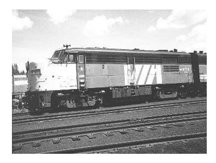
Prior to shipment to Arizona FPA-4 6776 basks in the warm Portola sunshine. - Frank Brehm

The Grand Canyon Railway has purchased our VIA units FPA-4 6776 and B-unit 6860. This brings the GCRY total to five cabs and two boosters. This additional power is primarily for a second train the Grand Canyon plans to be running by the spring. After an inspection in Portola CMO Franzen stated the pair are in very good shape, but that they do need some work and paint. A work crew from GCRY were in Portola during the first week of June to prepare the units for the trip to Arizona and their new home on the GCRY. This preparation included removing any easily pilferable items, making protective covers for all cab windows and welding the doors and electrical cabinets shut. The units were transferred to the UP on June 17th and arrived at the Grand Canyon on July 7th. Work is now underway on the units with an expected in-service date of March 2000.