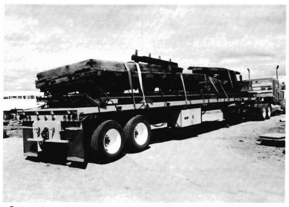
Our push carts, switch parts, rail and other track materials are shown loaded on the truck in Oregon ready to leave for Portola. Story inside.