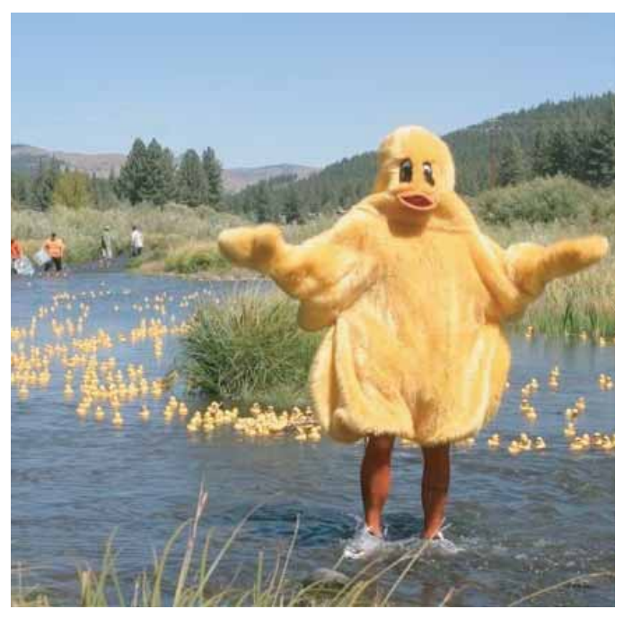
Rubber ducks fill the Feather River during the Portola Railroad Days "Lucky Duck Race".

If you have an opportunity to meet any of these hard working people, please be sure to thank them for their dedication to the organization and for giving of their time and sweat to make your Feather River Rail Society, and Western Pacific Railroad Museum, prosper.