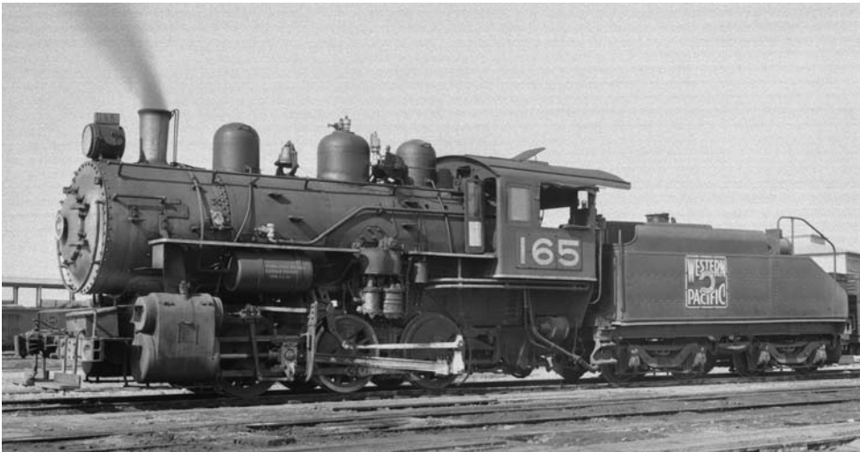
left - Our 0-6-0, WP 165, is captured hard at work in Stockton on November 8, 1938.