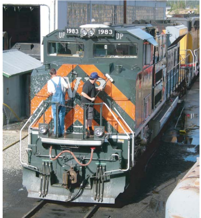
Union Pacific SD70M 1983, the Western Pacific Heritage Locomotive, gets a scrubbing from our volunteers before Railroad Days.