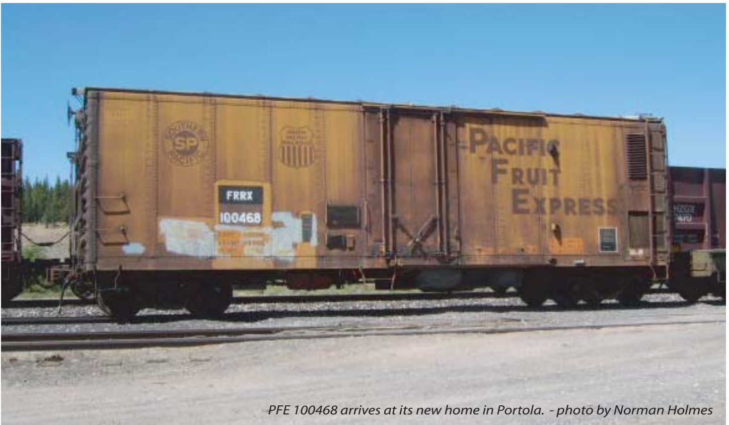
PFE 100468 arrives at its new home in Portola.

Our car came to us as a donation from the California State Railroad Museum. Due to a change in plans for their museum expansion into the old Southern Pacific Shops they found they had more equipment than they had space to store and display. A number of cars and locomotives were transferred to other museums.