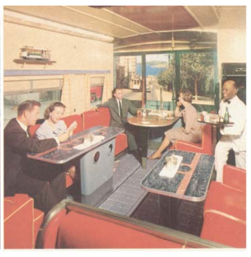
As gay and colorful and as much fun as San Francisco itself, the "Cable Car Room" Buffet Lounge serves light meals and beverages from morning 'til evening.