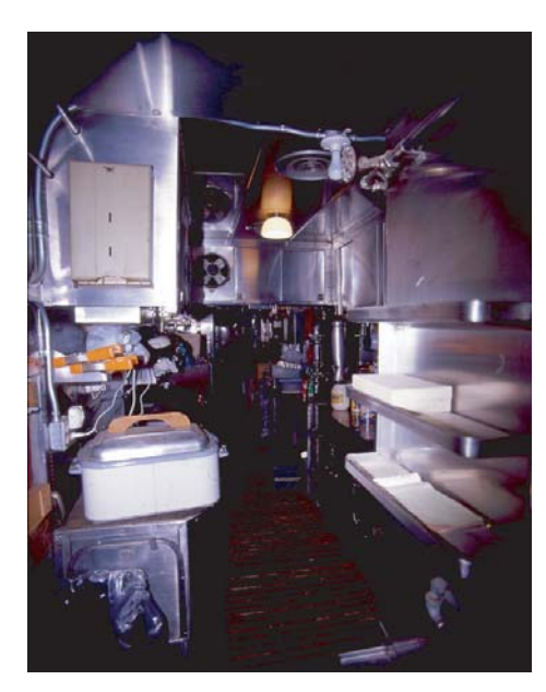
The car's interior (left, with temporary folding chairs) show wear and tear, but is fairly complete. The kitchen (above) is like a step back into time.