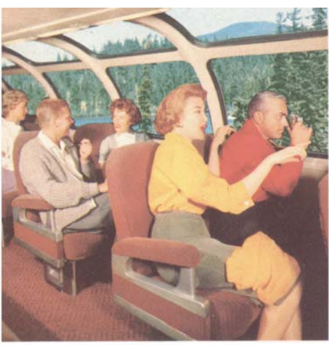
Upstairs in one of the five glass-enclosed Vista-Domes for Chair Car and Pullman passengers, you can look up, look down, look all around. 120 extra unsold seats!