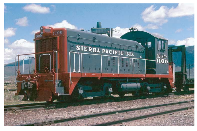
Quincy Railroad 1100 is one of our workhorse engines in Portola. A rare TR6A switcher built by EMD, she served the Quincy for many years. Shown here in Susanville, CA in 1991.

The prompt action of these two capable members helped keep an important piece of Museum equipment ready for service.