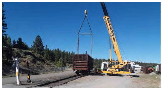
Almost a year after the proposal to donate one of our beet gondolas to the Arizona Railroad Museum was approved at the July 2018 FRRS Board Meeting, SP Beet Gondola SP 359247 is being loaded leaving the WPRM for Arizona.