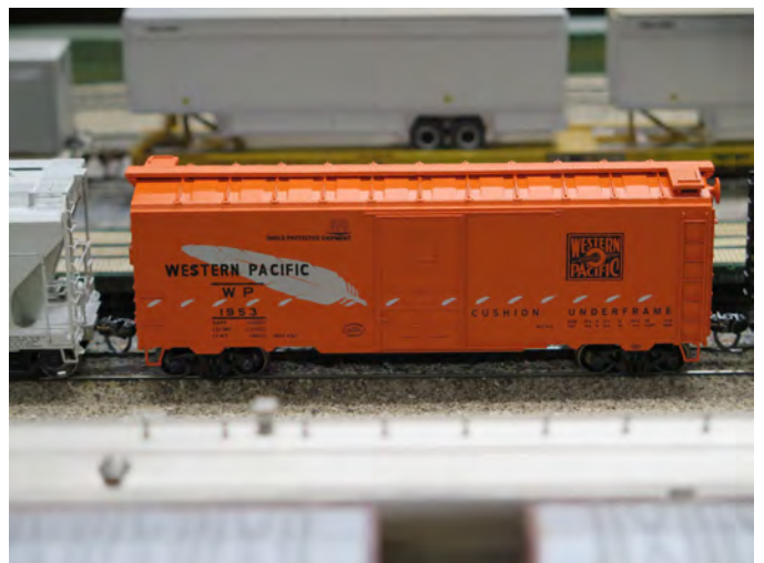
WP 1952 Box Car