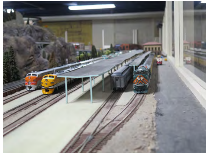
Welcome to the Station