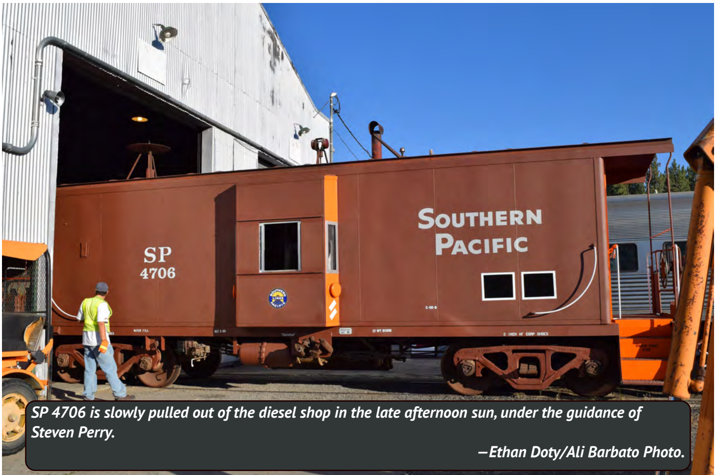
SP 4706 is slowly pulled out of the diesel shop in the late afternoon sun, under the guidance of Steven Perry.