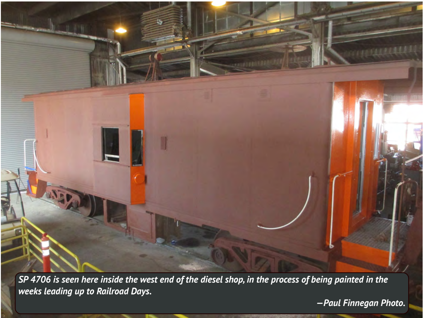
SP 4706 is seen here inside the west end of the diesel shop, in the process of being painted in the weeks leading up to Railroad Days.