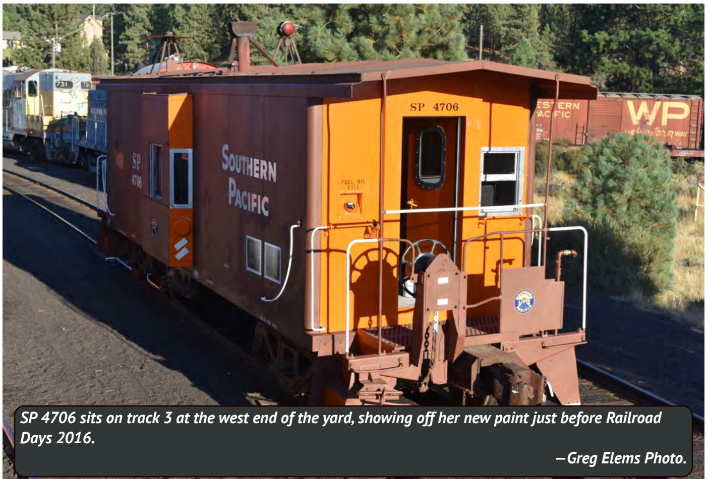
SP 4706 sits on track 3 at the west end of the yard, showing off her new paint just before Railroad Days 2016. —Greg Elems Photo.