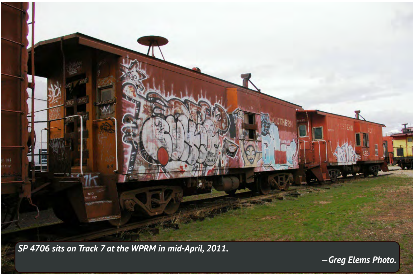
SP 4706 sits on Track 7 at the WPRM in mid-April, 2011.

Follow along and take a look at the progression from 'before' to 'after':