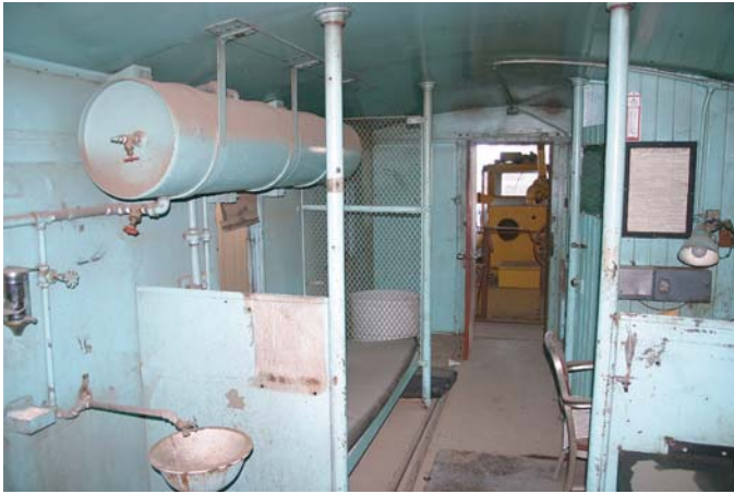
The 24's interior is still intact and mostly unchanged from its service days.