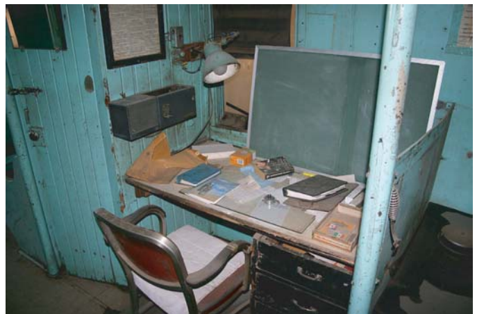
The conductor's desk still has paperwork and log books on it. Other forgotten personal effects were found in the car and will be saved for preservation.

Now, 33 years later, my short time on the CCT is just a long ago memory chronicled in my old UTU timebooks. Today's assignment off the Roseville south engineers extra board is at the