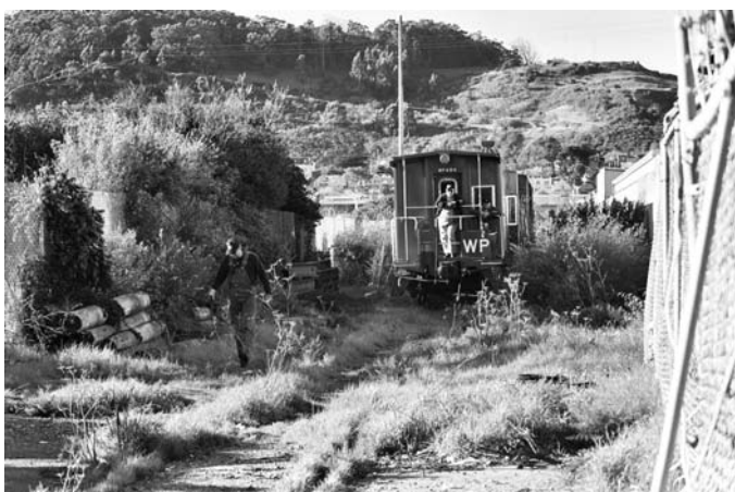
WP 484 leads the way during a shove down the weed-covered and twisting Hunter's Point spur.

By the third week in February, the end was in sight. Most of the equipment had been inspected and cleared for travel. Moving out of Hunter's Point would be as large a task as getting everything ready in the first place. The line connecting the museum to the outside world is a twisting industrial spur that wanders between buildings astride soggy and well worn ties. There was no way the entire train, which would eventually number 37 cars and locomotives, could be moved in one shot. On February 23, the first cut rolled out the main gate, as WP 707 took SP 4450, two SP F7As, the triple unit diner and an ex-SP articulated double unit coach out to the CalTrain mainline.