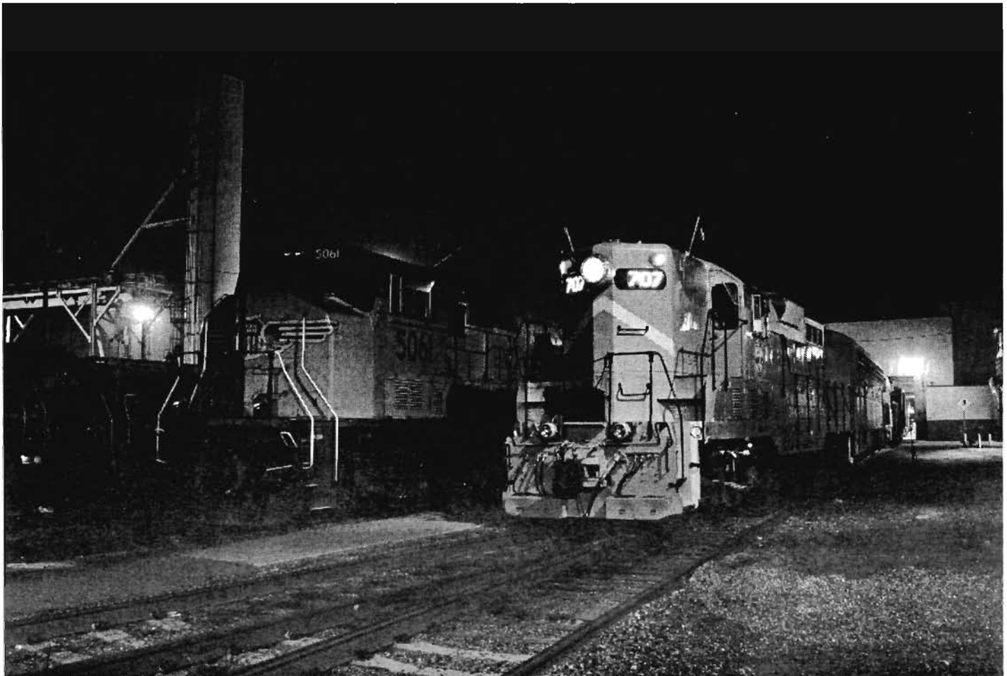
WP 707 keeps company with UP 5061 in Stockton.

The massive effort to relocate the majority of GGRM's equipment began several months earlier. In August, 2005, the US Navy served notice that all tenants of the Hunter's Point Shipyard, GGRM's home for many years, would