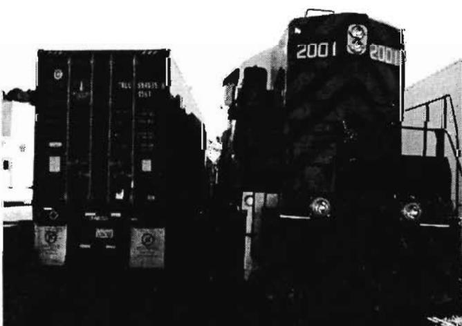
WP 2001 eases past a poorly parked truck.