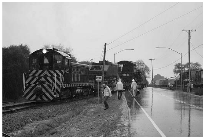
WP 165 is shoved onto the NCRy/UP interchange by PLA's SP 1423. She will be coupled into the train and soon complete her journey home.

This was a once in a lifetime move that went flawlessly and safely. Three organizations worked together in a tremendous show of cooperation to make this happen, helping out a friend in need. Huge thanks to all the FRRS personnel that helped make this possible, and to all the GGRM and PLA personnel who worked to make this event successful and safe.