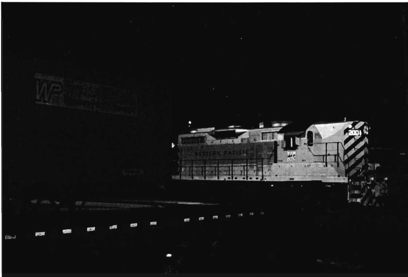
Once again in WP Stockton Yard, 2001 sits near a WP trailer.

have their leases canceled and be required to vacate the premises by mid-February, 2006. Soon after the announcement, discussions began within the FRRS toward offering our expertise in over-the-road equipment moves to GGRM. The scope of the task was daunting. Some 30 cars, mostly passenger cars and many on plain bearing trucks, would need to be prepped for mainline movement. Most of these cars had not been outside of Hunter's Point in over 15 years. Every single one would need to be inspected, repaired and certified for service. And less than 6 months was available to make it happen.