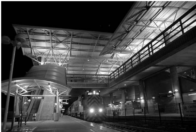
Rolling through the Millbrae CalTrain/BART depot.

equipped cars in the consist. Gail McClure and Eugene Vicknair acted as the ground support crew, rolling the train by at various stops, including the recently opened Millbrae CalTrain/BART depot. The combination of orange and silver power, early 20th century passenger cars and 21st century transit architecture created a truly surreal moment.