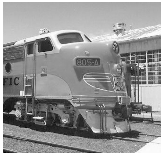
The 805A as it appears today in Portola.