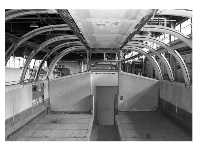
An early view of the "Silver Hostel" dome area, restoration work is continuing and nearing completion.