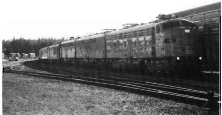
Top photo: The 805A is shown with the Circle the Wagons crew and the Nevada Museum's steam crew. Middle: A perfect threesome, our 921D, 805A and CSRM's 913 lined up in a perfect pose. Bottom: The Pacific Limited train rumbles into Portola with one of the Keddies turning during Circle the Wagon weekend.