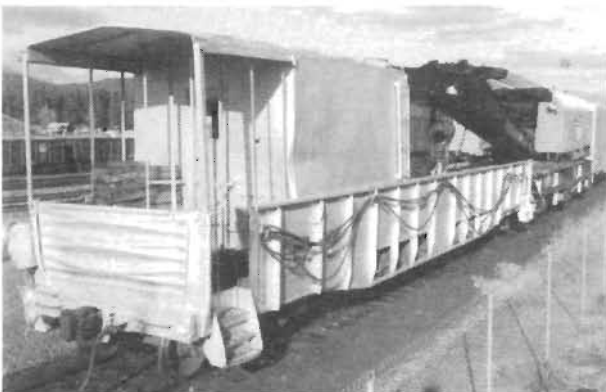
Boom car 37-1, which came with derrick No. 37, was converted from a WP 6550 series gondola car.

We want to congratulate Louise Reith of Tahoe City, who won the two free tickets last September 15. Support your railroad museum, buy these raffle tickets.