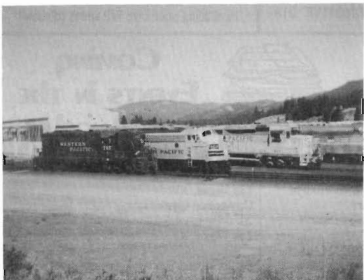
GP7 WP707, F7 WP921D, and GP30 UP849 lined up for a portrait in front of our engine house.