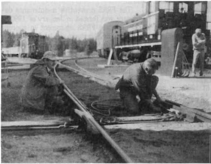
Ron Mathew from R.G. Mathew, Inc. in Grass Valley is shown installing an ice melting device on our terminal switch to test it.