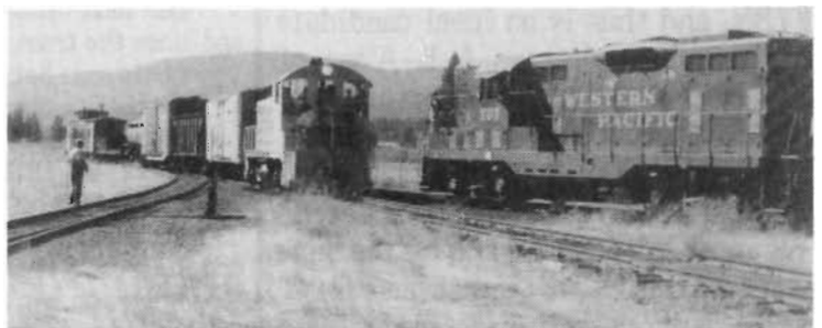
50-year-old NW-2u WP608 has brought the 1940's freight train around the balloon loop and heads into Rip Track #1 past Malfunction Jct. and the 1960's train waiting in the Ramp Track.