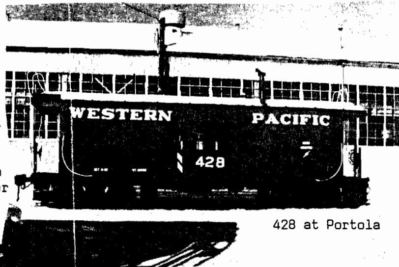
428 at Portola

Since the take over UP is retiring a lot of cabooses and series 426-460 days in service are numbered, specially the ones not rebuilt. The 428 is painted box car red with white lettering and is correct as several cabs were painted this way before red was used. A time in the future we'll paint it as delivered but for now since Chris painted the inside and reinstalled the equipment inside it's like a new caboose.