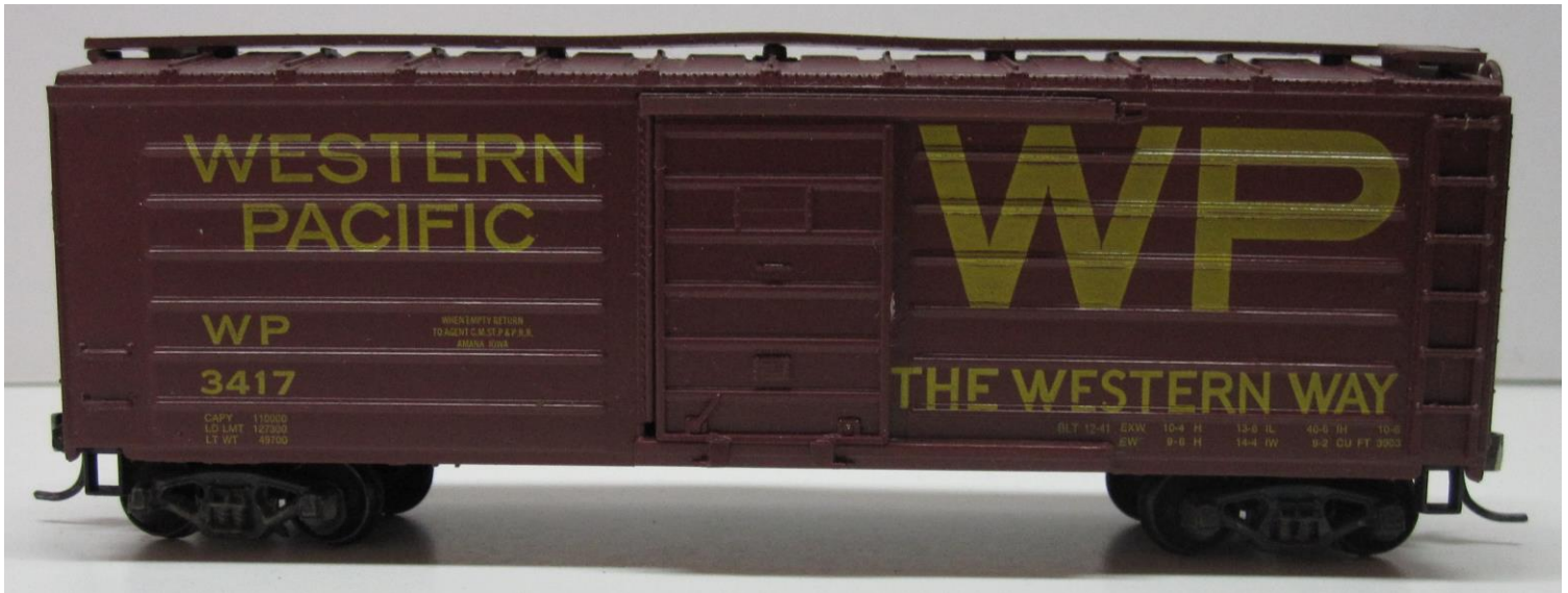
MDC Roundhouse # 1025 boxcar.

One of the more interesting 40 foot boxcar that the Western Pacific had in their freight car fleet, is a 40 foot Milwaukee Road ribbed side car. WP purchased two of these cars in 1962 when they needed to fill a specific shipper (appliance service pool) and instead of purchasing them new, WP found two cars from the Milwaukee Road. The two cars were built for the Milwaukee at their West Milwaukee Wisconsin shops in 1948-49.