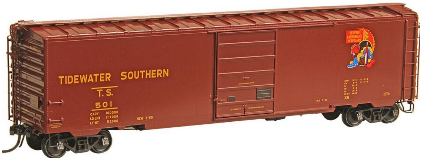
Kadee 6406, Tidewater Southern # 501 50 foot 8 ft 6 Panel Superior Doors, Built 1955, Boxcar Red Two of the Kadee TS cars, # 501 and # 509 were produced for the 2019 Joint PCR/FRRS convention in Sacramento (both now out of production).

Boxcars from the late 1930's and early 1940's to the 1980's are manufactured by several model companies. Here I list just a few, you may wish to perform an internet search and you will find several results for these cars.