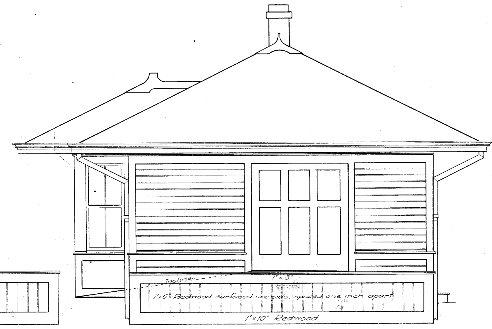
Freight Room End.