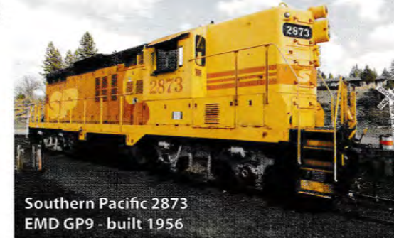
Southern Pacific 2873 EMD GP9 - built 1956