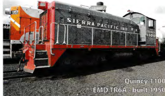
Quincy 1100 EMD TR6A - built 1950