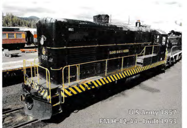
U S Army 1857 FM H-12-44 - built 1953