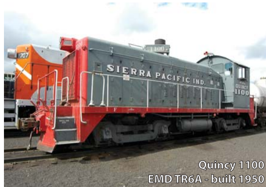
Quincy 1100 EMD TR6A - built 1950