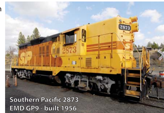
Southern Pacific 2873 EMD GP9 - built 1956