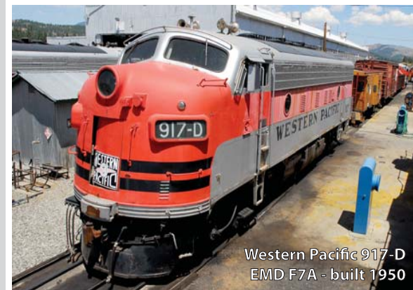
Western Pacific 917-D EMD F7A - built 1950

Locomotive availability is subject to change due to maintenance requirements or other factors. Please check our website at www.RunALocomotive.com for special offers and availability. Prices effective starting July 1, 2017 and are subject to change.