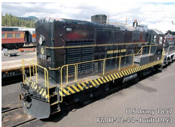
U S Army 1857 FM H-12-44 - built 1953