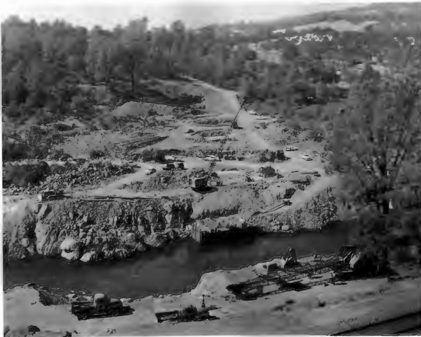
No. 189-4 10-16-58 Feather River Bridge. View ahead on line from Pier No. 2. Crane placing concrete at Pier No. 4.