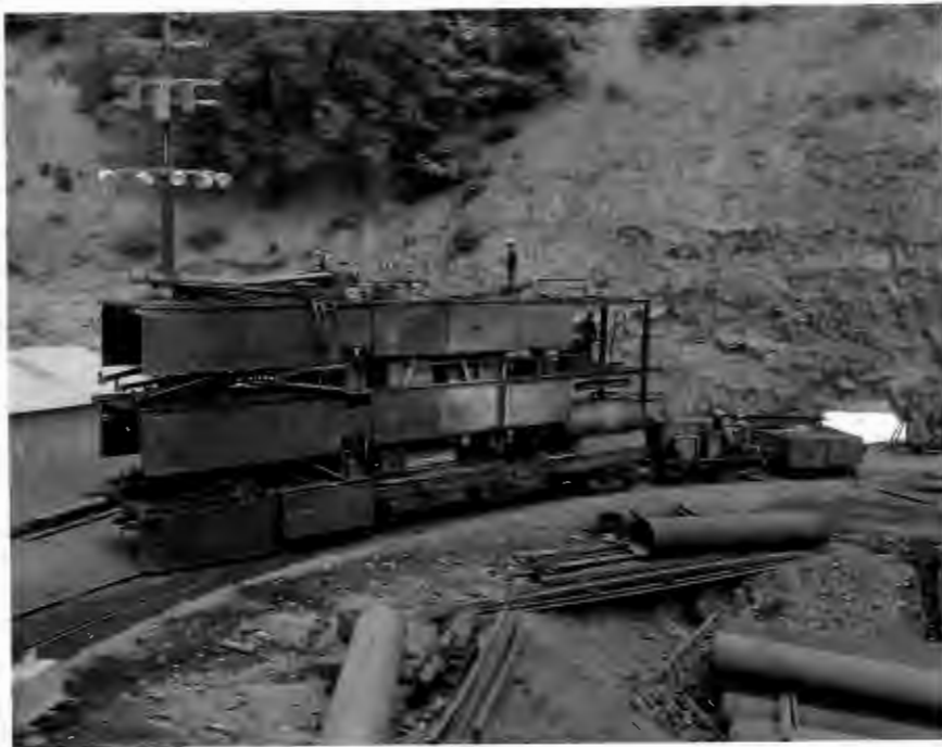
No. 149-9 7-29-58 Tunnels 4 and 5 (W.P.R.R. 7 and 8). View of drilling Jumbo being loaded with lagging prior to run into tunnel.