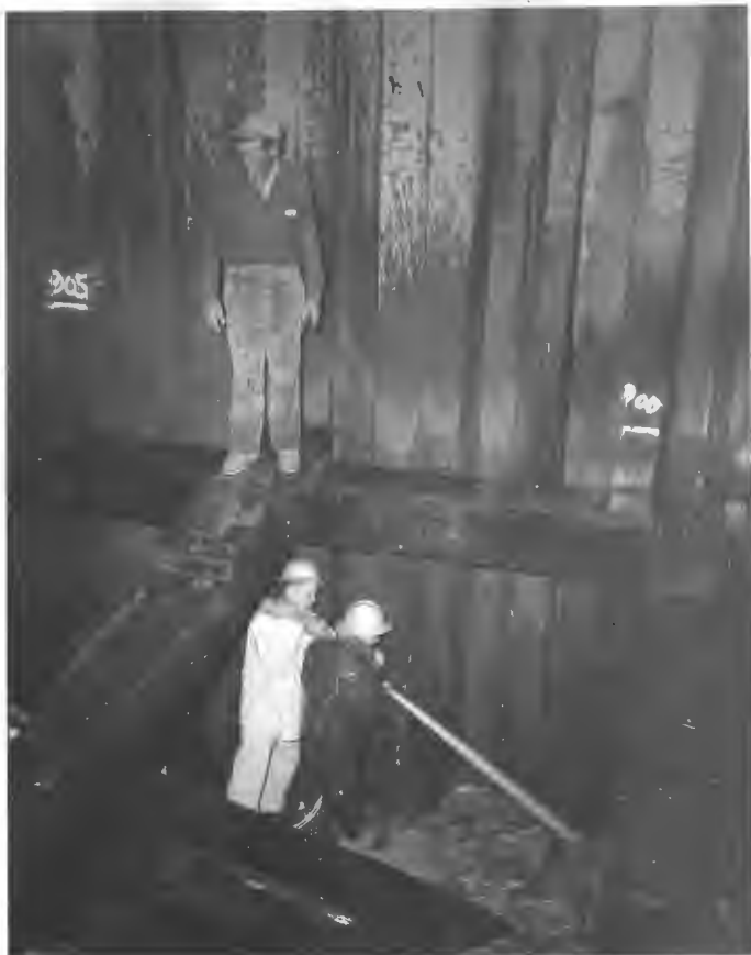
No. 191-1 10-16-58 North Fork Bridge. Washing down bedrock before placing reinforcing steel at Pier No. 3.