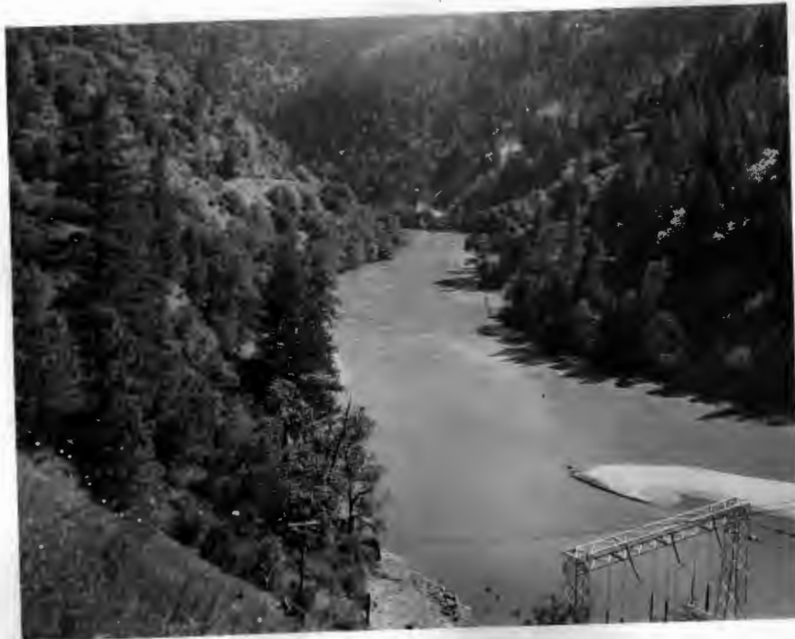
No. 118-6 4-22-58 Looking downstream from PG&E sandbar to left abutment and tie to existing W.P.R.R. at top left across river to west abutment at top of cleared area above water in center.