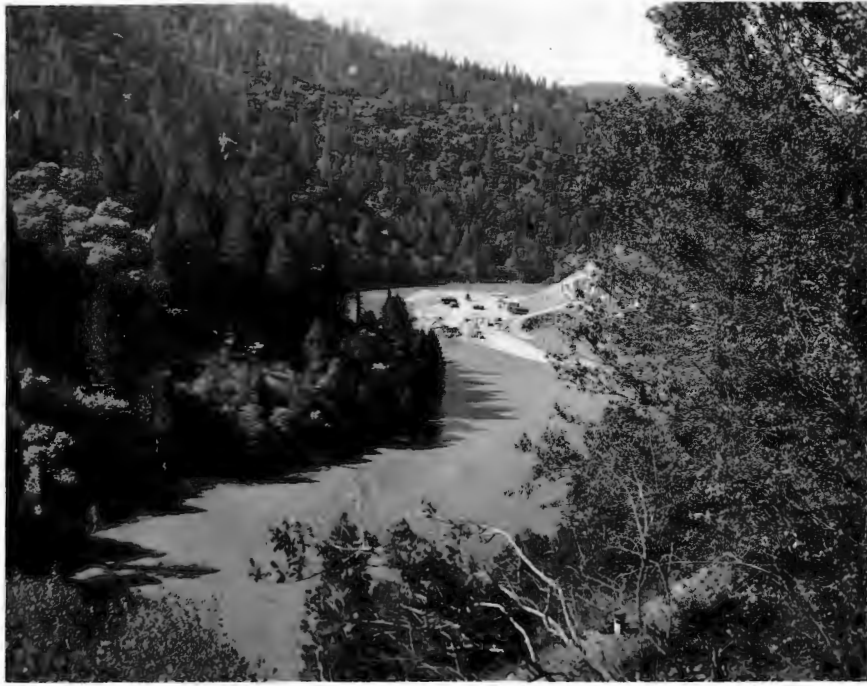
No. 118-5 4-22-58 North Fork Bridge looking upstream. Beginning at north side of low level crossing PG&E sandbar in center to be used as Contractor's yard.