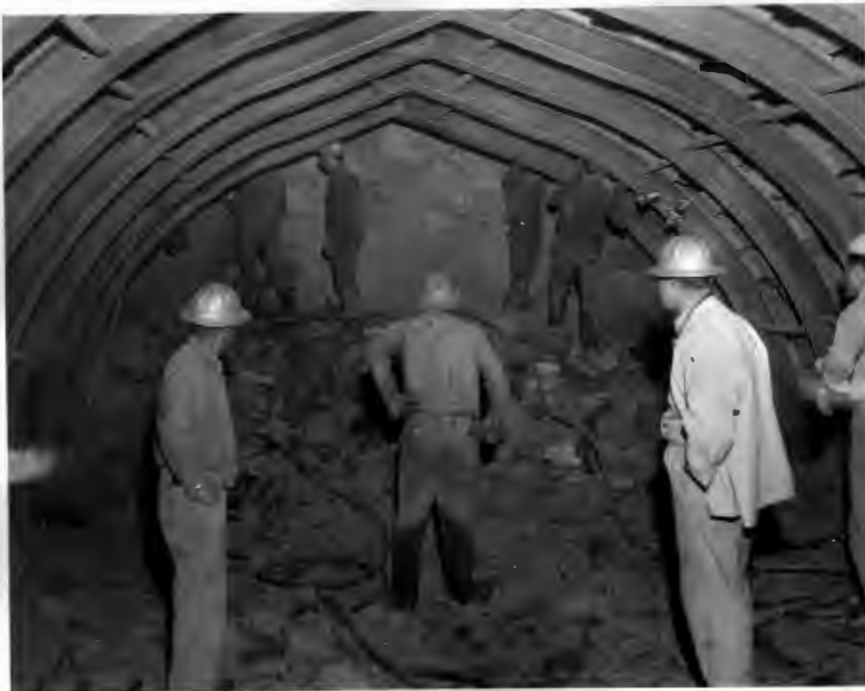
No. 188-5 10-25-58 Tunnel No. 4 (W.P.R.R. No. 7). Placing final lagging prior to holing out of Portal 4W.