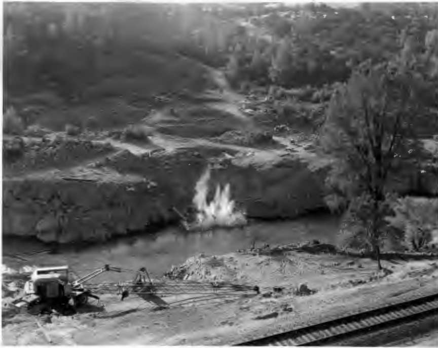
No. 168-1 9-19-58 Feather River Bridge. View of underwater blast at Pier No. 4 looking ahead on line at succeeding pier locations.