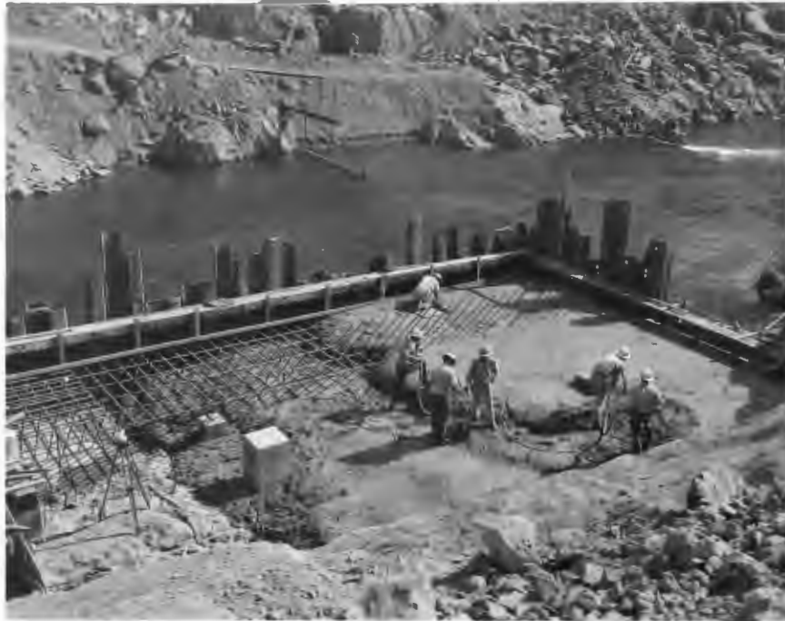
No. 189-3 10-16-58 Feather River Bridge. View back on line at concrete placing operation at Pier No. 4.