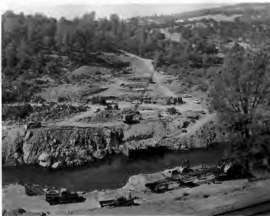
No. 189-4 10-16-58 Feather River Bridge. View ahead on line from Pier No. 2. Crane placing concrete at Pier No. 4.