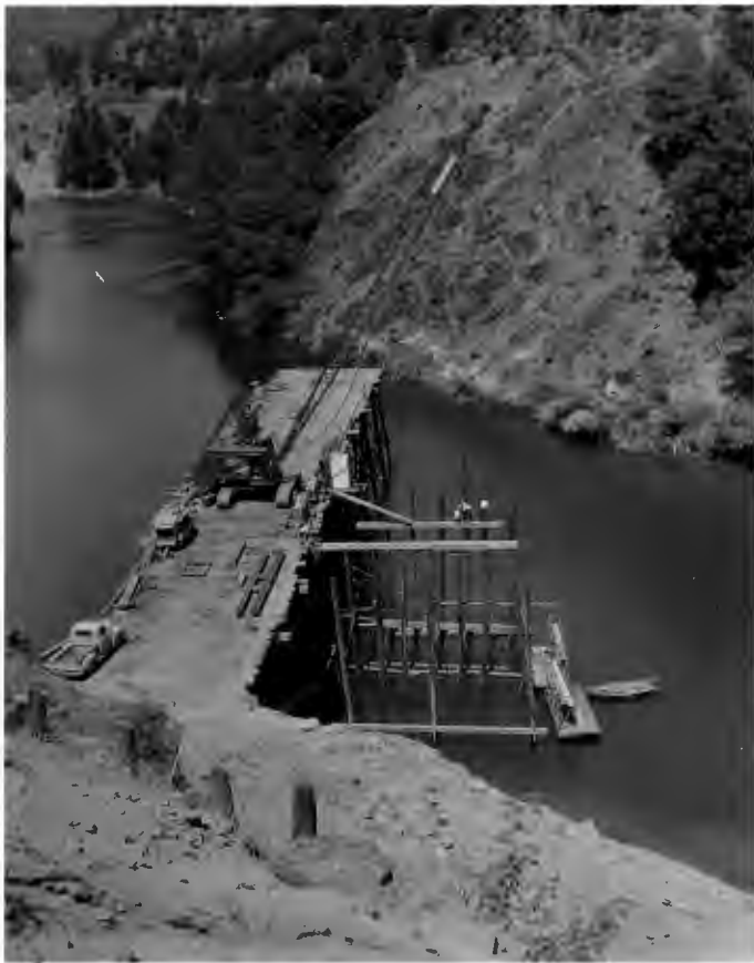
No. 146-5 7-29-58 North Fork Bridge looking upstream at Contractor's work trestle. Pier No. 2 in fore- ground. Pier No. 3 across the river.