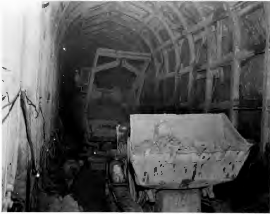
No. 154-1 8-18-58 Tunnels Nos. 4 and 5 (W.P.R.R. Nos. 7 and 8). Loading muck train after blasting. Note rock being moved to forward part of train.