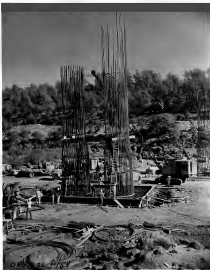
No. 202 11-7-58 Feather River Bridge. View showing men and equipment at work placing concrete on Pier No. 8.