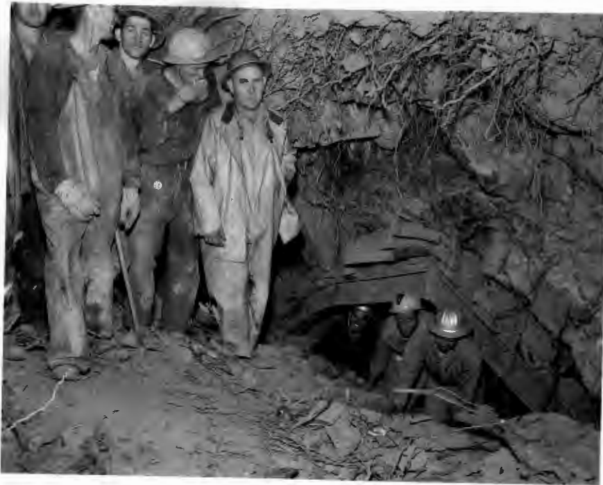
No. 188-3 10-25-58 Tunnel No. 4 (W.P.R.R. No. 7). Hole through at Portal 4 West, 1:44 a.m., October 25, 1958. Ten months elapsed time.