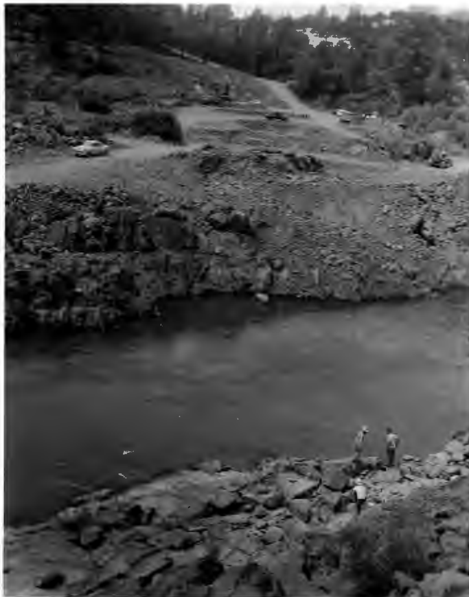
No. 147-1 7-29-58 Feather River Bridge. Three men standing at location Pier No. 3. Pier No. 4 directly across stream. Pier No. 10 located at top center looking ahead on line.