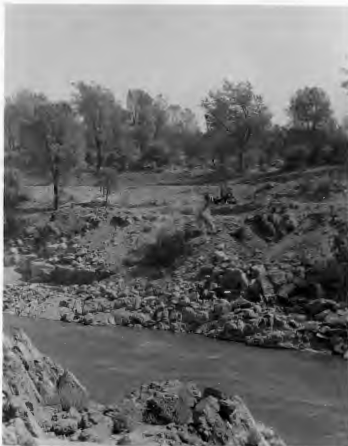
No. 157-3 9-8-58 Feather River Bridge excavation proceeding at Pier No. 2. Existing W.P.R.R. track in back- ground.