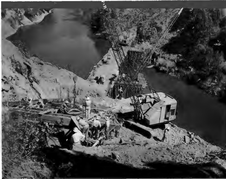
No. 166-1 9-19-58 North Fork Bridge. Placing concrete for footing Pier No. 1 - view ahead on line shows Contractor's work trestle near completion.