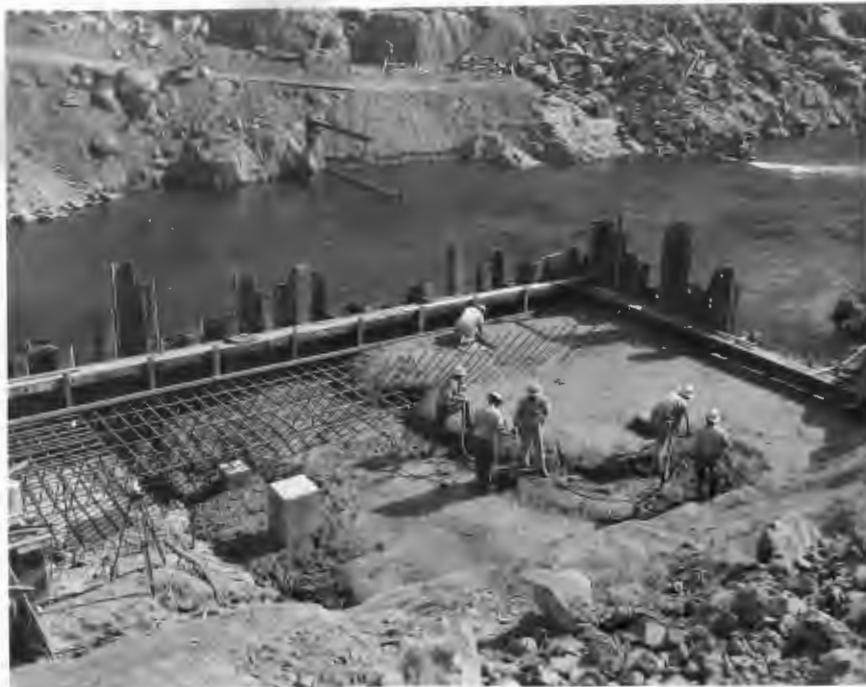
No. 189-3 10-16-58 Feather River Bridge. View back on line at concrete placing operation at Pier No. 4.