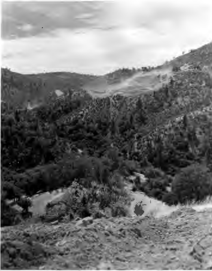
No. 162-1 9-11-58 Wicks Corner - Jarbo Gap Grading operation at the south approach to West Branch Bridge, view from Deer Peak