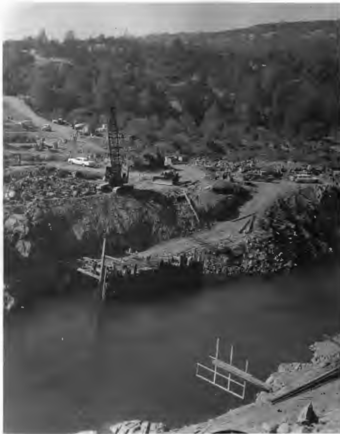
No. 174-1 Feather River Bridge