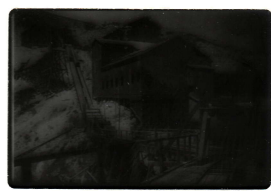
TESLA MINE Bldg 1898