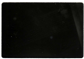
TESLA EUREKA VEIN