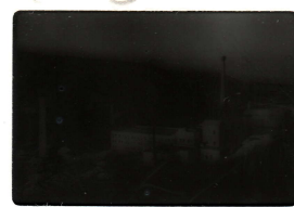
CARNEGIE BRICK PLANT 1905