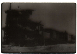
AL & S. J. TRAIN WATER TANK