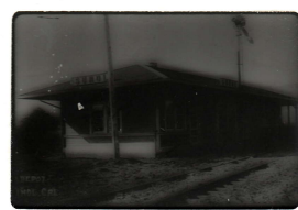
WP SUNOL AUG 1-1900