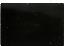
CARNEGIE BRICK PLANT 1904