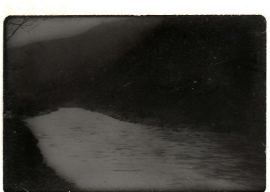
WP BUILDING NILES CANYON