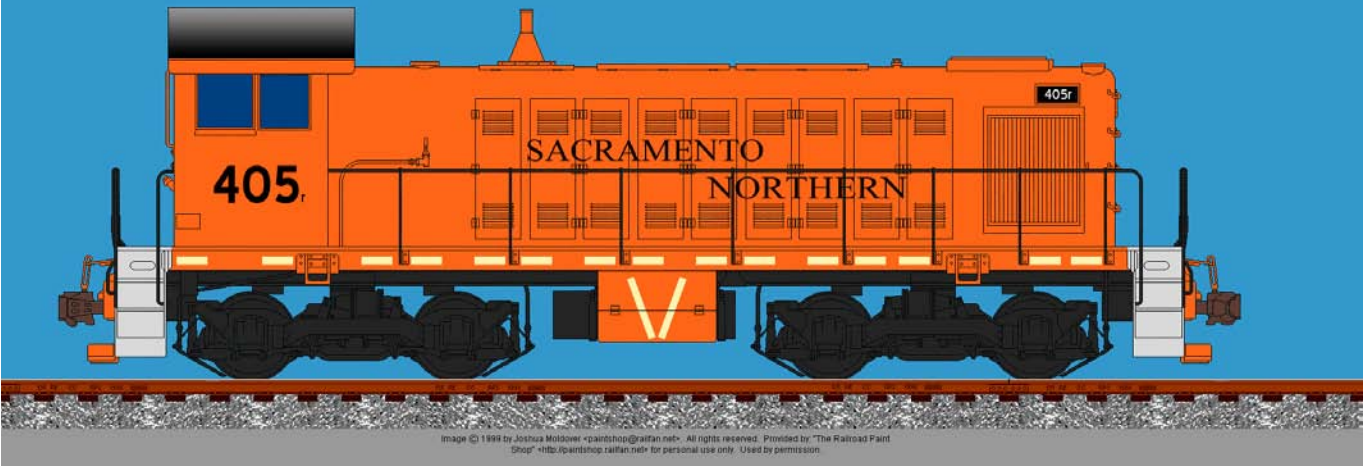
Sacramento Northern solid orange