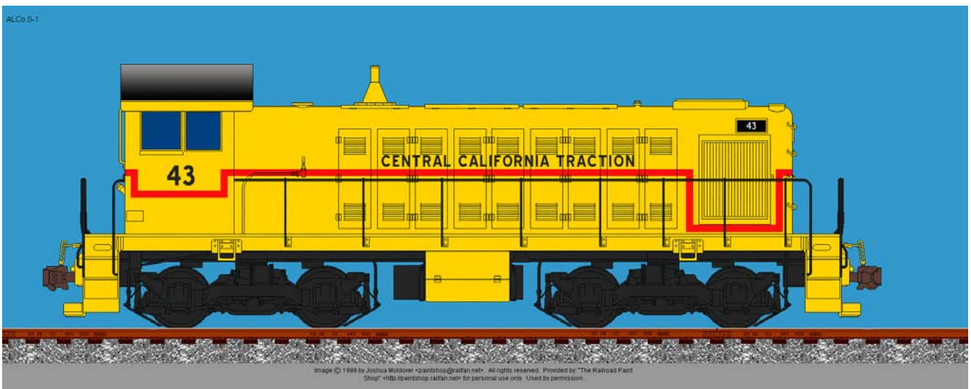
Central California Traction Company chrome yellow