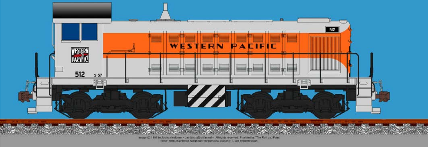
Western Pacific Zephyr silver and orange