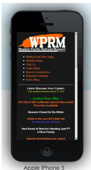
Apple iPhone 5

Examples of what the mobile home page looks like on various devices: