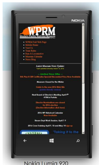
Nokia Lumia 920