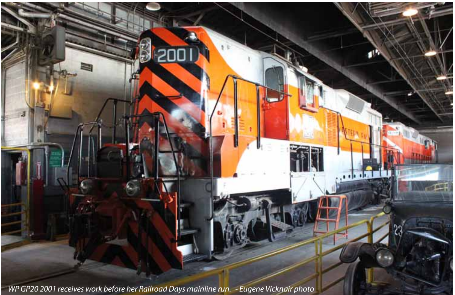
WP GP20 2001 receives work before her Railroad Days mainline run.