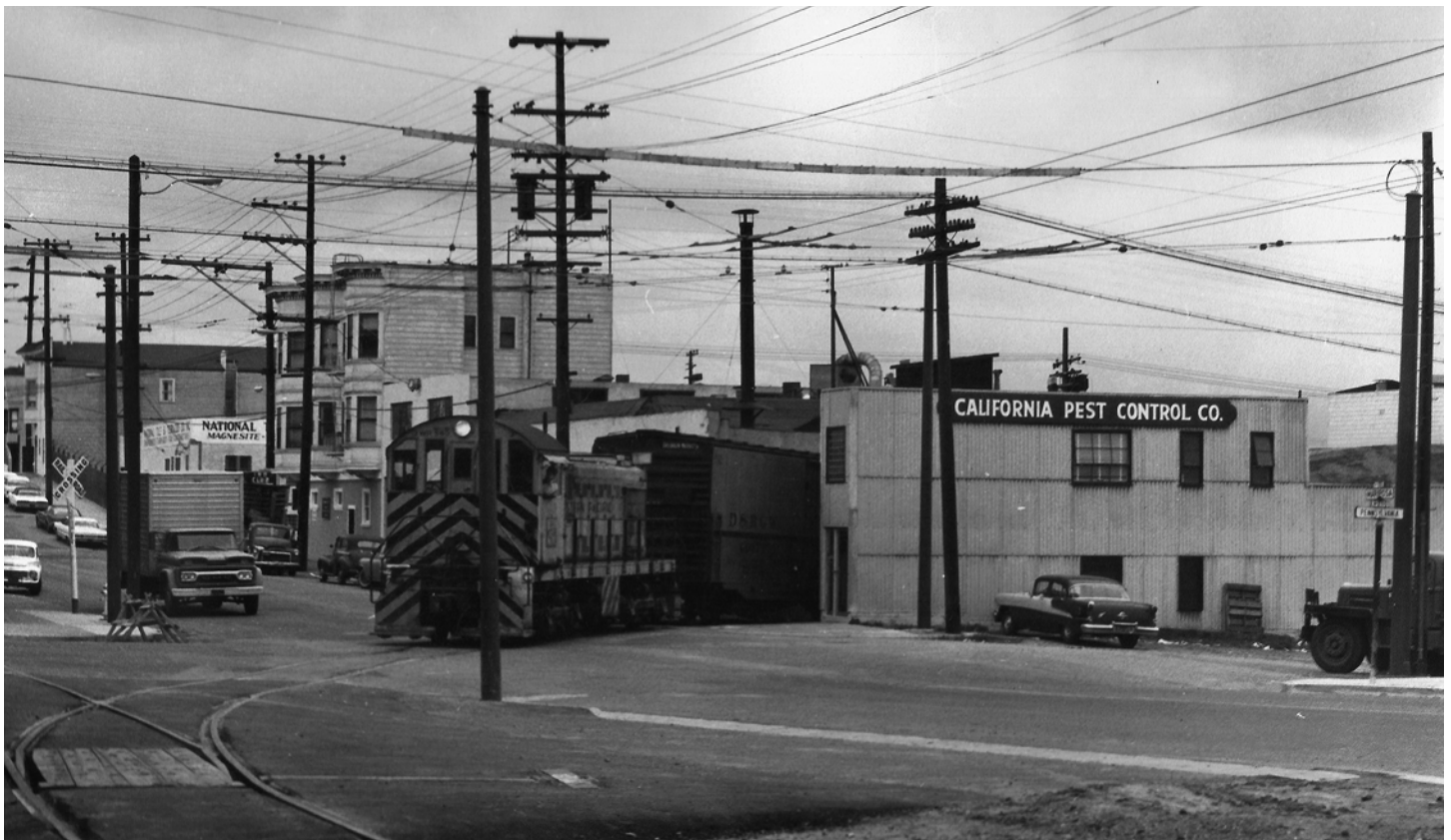
FROM THE PAST - A WP Alco S2 pulls a cut of cars across Mariposa Street in San Francisco. The train is leaving joint Southern Pacific - Santa Fe rails and about to roll onto Santa Fe tracks. This is all part of the trackage rights WP obtained in 1962 to bypass burned out Tunnel A.