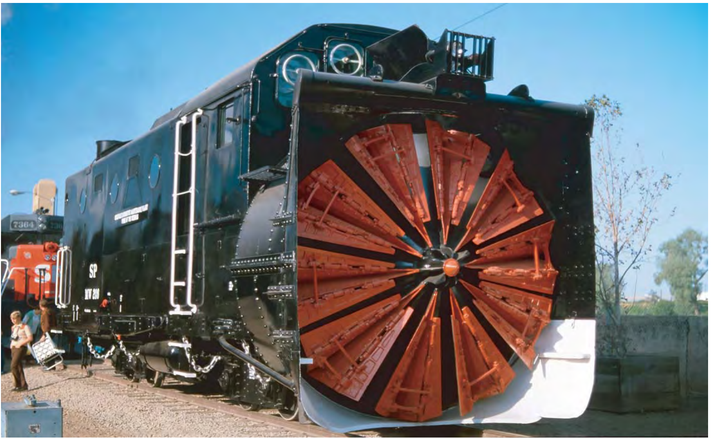
SP Rotary Plow MW208, now preserved at the WPRM, is shown here on display at the opening of the California State Railroad Museum. The date is May 21, 1981.