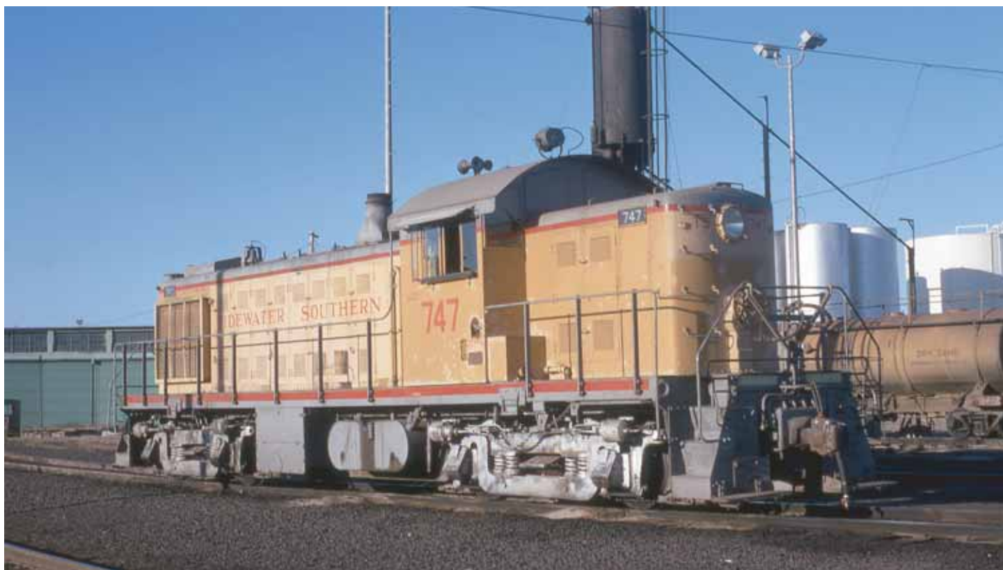
Wearing UP colors, Tidewater Southern RS-1 waits the next call for duty in Stockton on June 13, 1971.