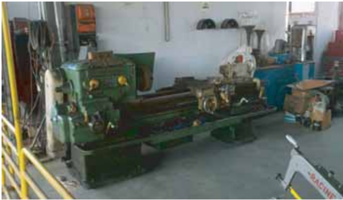
Our "new" 16" lathe indoors at last!