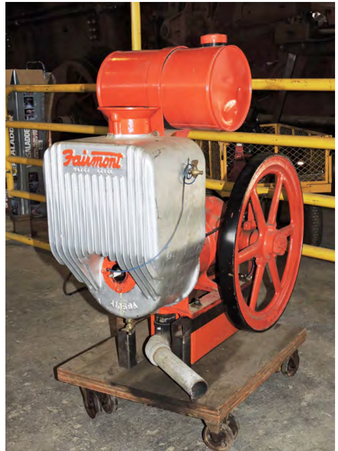
Fairmont motor with double wheels and pulley at the WPRM

Using engine-starting fluid (ether), I was able to get it started and it ran for about ten seconds. I understand that it will run on regular gas with 2-cycle oil mixed in. (Per information from the West Coast Railroad group in Virginia City, the proper mix is 6 oz./gal.)