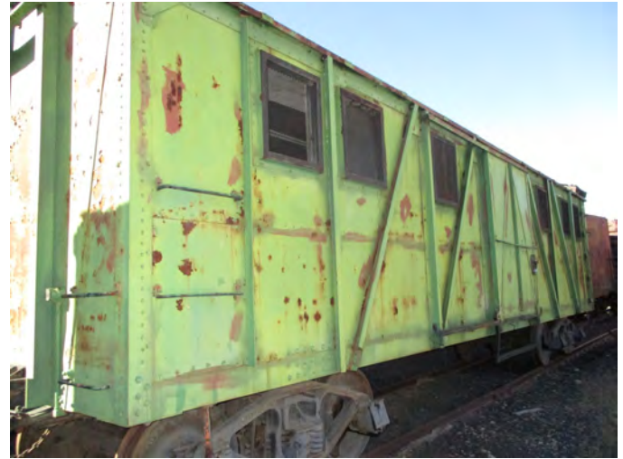
USA Ammo Car - CLV Pay Car

In 2001 the car was donated to the FRRS and moved to Portola again where she remains today.