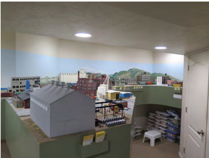
Yard and Industrial area