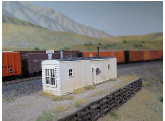
Cooper Siding Crew Office