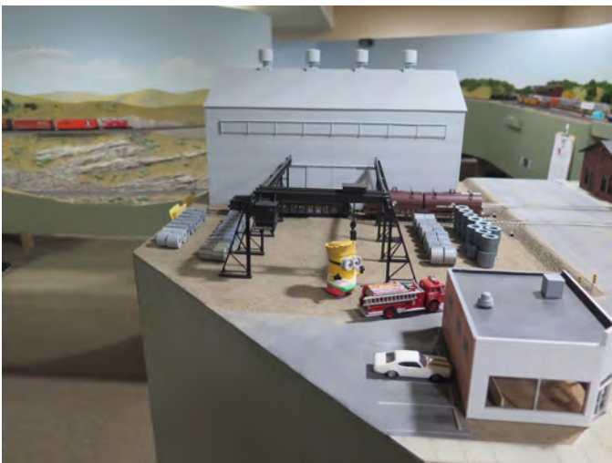
Minion invade the layout