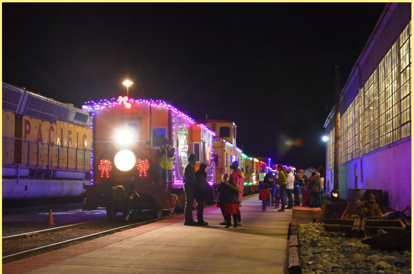
The Santa Train backs into the loading platform on 9 December 2017 after another successful run.

A new Sleeper Reservation process and procedure is now on the society's website,