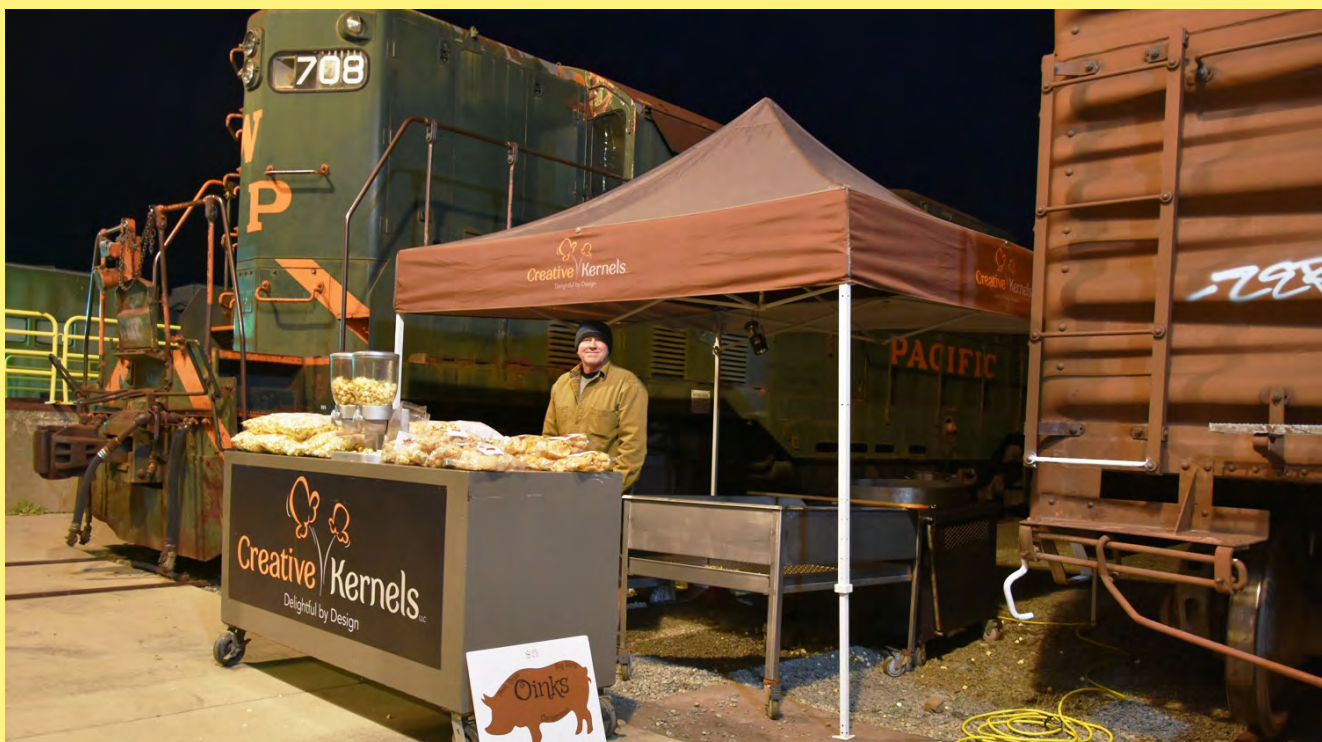
Creative Kernels was set up supplying candied pop corn on 2 December, 2017 on the West End of the Diesel Shop.

Train "Nuts" do a lot of crazy things to get pictures of trains and I am no exception. It all depends on what you are willing to do that THAT PICTURE . I do GO FOR IT!