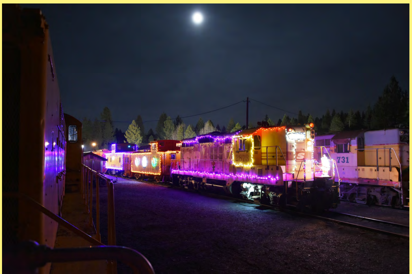
The Santa Train backs into the loading platform on 2 December 2017 after another successful run.