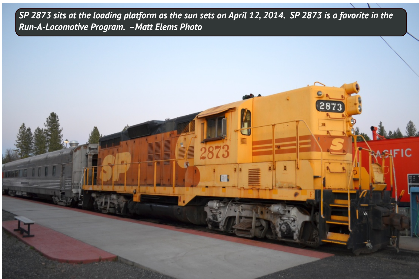
SP 2873 sits at the loading platform as the sun sets on April 12, 2014. SP 2873 is a favorite in the Run-A-Locomotive Program.

PRSR STD U.S. Postage PAID Permit No. 580 Manhattan, KS 66502