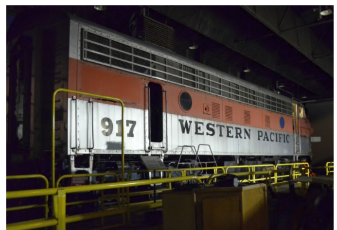
WP 917-D sits in the WPRM shop overnight during mechanical work and rust abatement on 12 April 2014. 917 is back in service in the RAL program as of 24 June 2014.