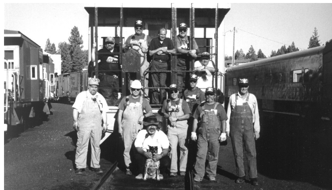
The operating crew for Railfan Day 2003

Should you have any question, please be sure to contact me.