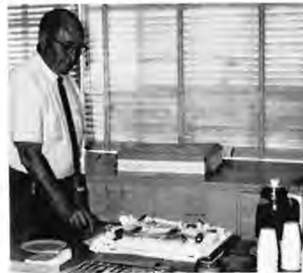
VOLUME 20, NO. 8 OCTOBER 1968