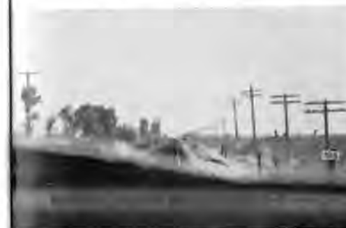
Milepost 186: Near 72-car capacity siding at Tambo as seen from Hy-Railer front seat.