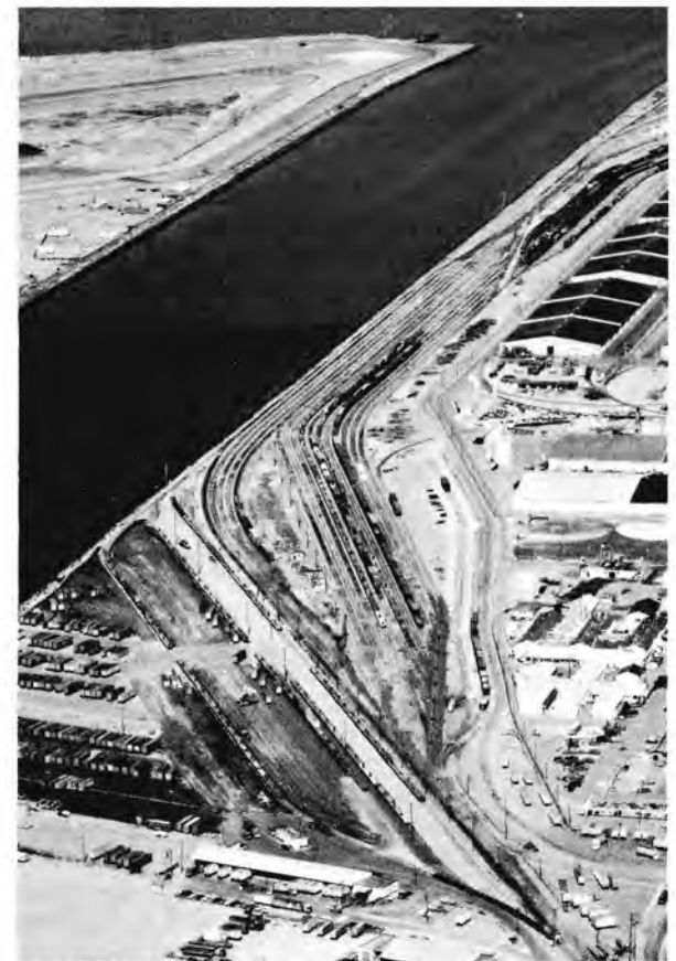
Port of Oakland aerial view of WP's Oakland container facilities.