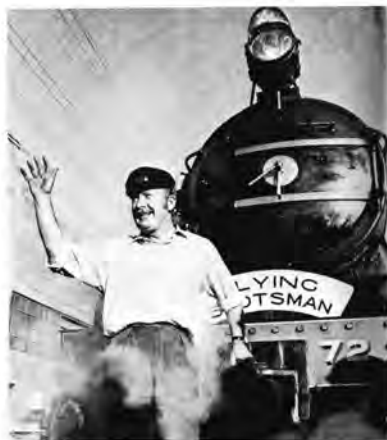
Her father, with baggy shirt and grimy hands indicating a day on the LNER 4472 footplate, waves to press photographers at Oakland as seen in Ted Benson's camera.