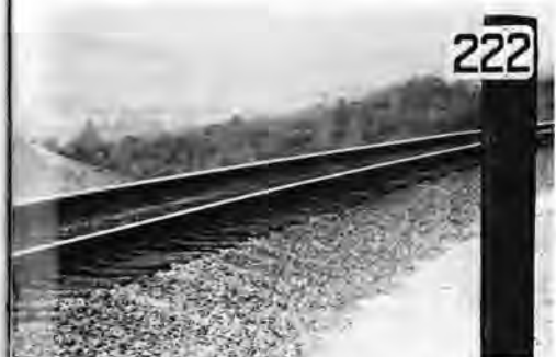
Milepost 222: Station James is in the distance just to the left of milepost sign.