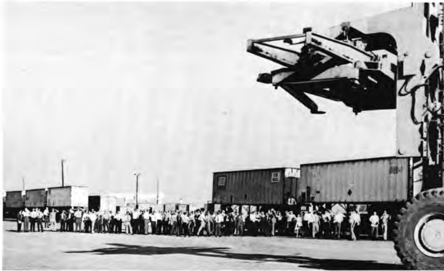
Above: WP's Oakland container facilities were opened to foreign and domestic visitors attending the 4th International Shipping & Containerization Exposition at Oakland in September. The tour included a demonstration of WP's massive LeTourneau side porter pictured on these pages.