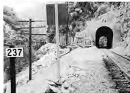
Milepost 237: Looking east through the 232 foot long tunnel number 10.