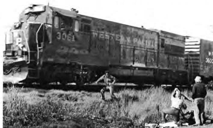
Two cameras are used to record this action shot ... one from a short distance down the track and a second 'close up' camera near track side.

At the end of this scene "O. J." stops beyond the tracks and raises a gun in defiance to the crowd that brought chase. With just 'one take' the director calls "Cut" ... "And Print It." For the before and after see "The Klansman."