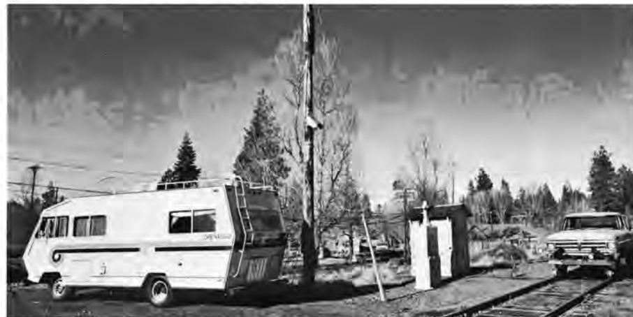
This portable 'open road' camper provided most of the comforts of a modern office for the temporary station operators on duty for a few days at Westwood, California. A WP "Hi-Railer," the type used for regular track inspection, is on the main line.