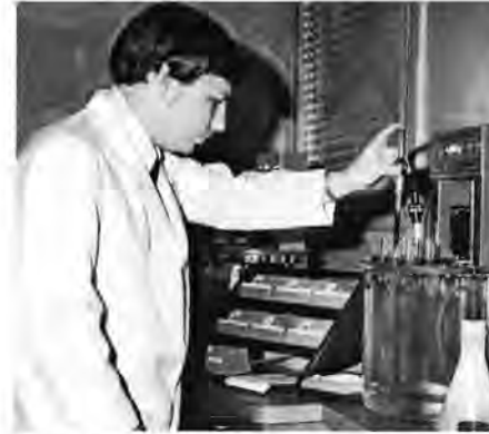
In the Stockton laboratory "spot tests" show the oil's ability to hold dirt and soot in suspension. This test measures the oil's ability to stop acid build-up.

or slippiness of the oil is measured by a special test. It shows whether the engine is getting fuel into the oil and thinning it out, creating a potentially explosive situation or if the oil is so oxidized from use that it has become