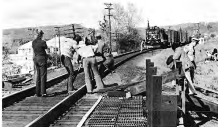
Cameras roll as "O. J." races across tracks ahead of WP freight.