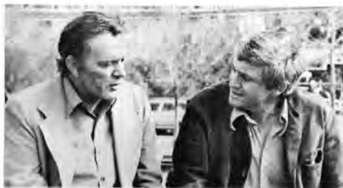
Richard Burton (left) is interviewed by Merv Griffin during the filming of a TV special on the movie set. (right) O. J. Simpson on location just prior to making railroad scene.

In addition to the use of the special train, the old WP passenger station was made up as the town's bus station for the movie. This well publicized film is scheduled to be released this fall.