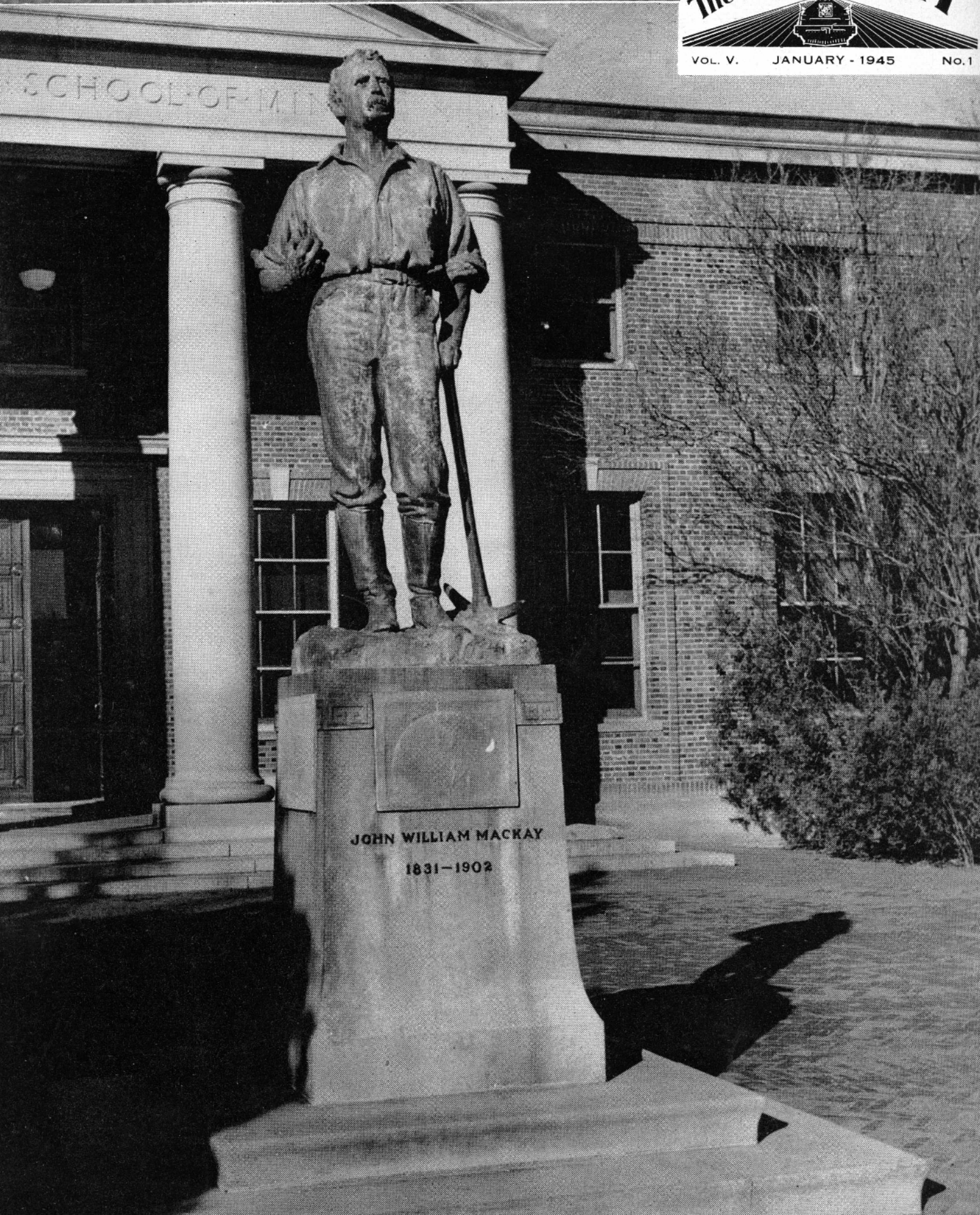
JOHN WILLIAM MACKAY 1831-1902