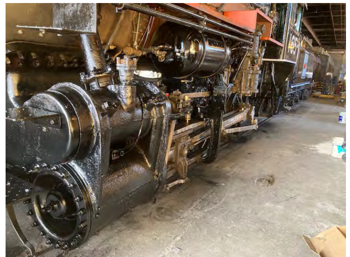
Fresh black paint on lower end of engine.