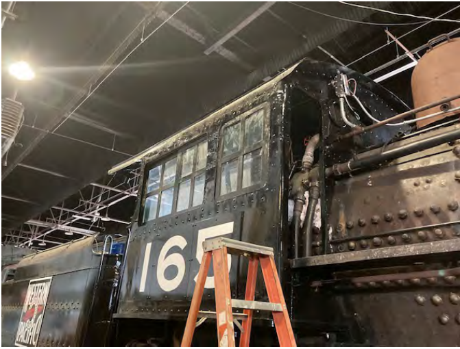
WP165 New cab windows