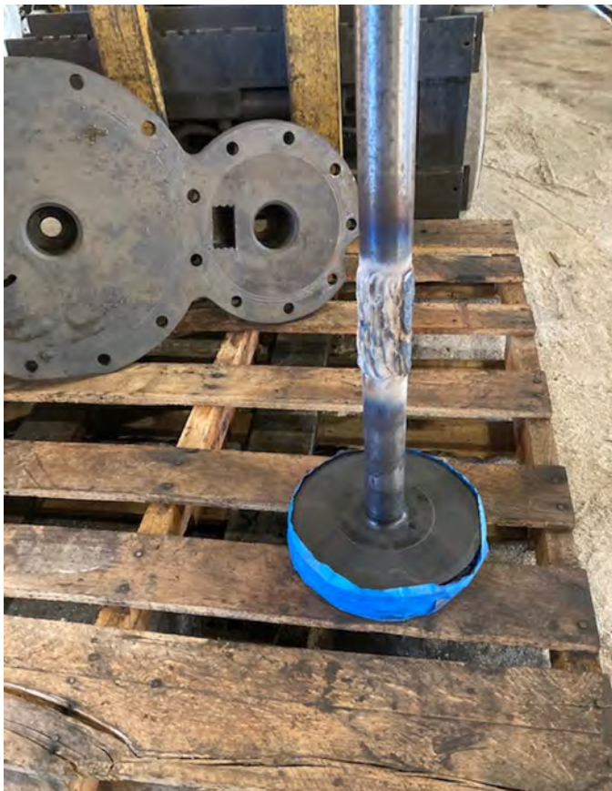
WP165 welded pump shaft before cleaning up on the lathe.

After the April runs, it was determined that the cross-compound air pump was working and did pass an orifice test, but that the shafts were pitted and causing the steam packing to degrade very quickly. Hank Stiles and I stayed an extra day at the museum and took the pump apart so that the shafts could be repaired. Back in 2014 we had taken a look at the pump, lubed it up, lapped in the check valves and ran the pump on shop air, but really never went any farther into the pump. Hank and I found, upon removal of the bottom head, a mess of dirt and old carbon. We were amazed that the pump was able to work as well as it did. I returned to the museum the week of May 2 nd to continue working on the pump. I removed the pistons and shafts and proceeded to weld up the shafts with a special welding rod made for the purposes of building up worn areas without distorting the original