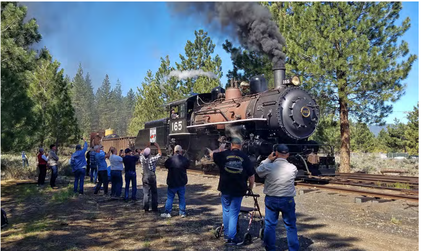
WP 165 Photo run by on Sunday May 15 th , 2022

PRESORTED STANDARD U.S. POSTAGE PAID San Jose, CA PERMIT # 10