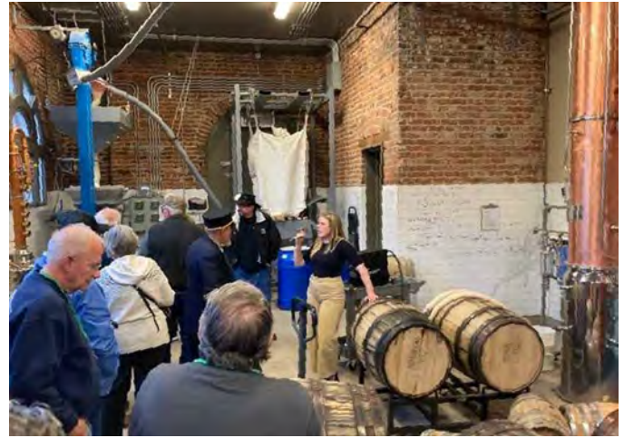
Touring behind the scenes at The Depot