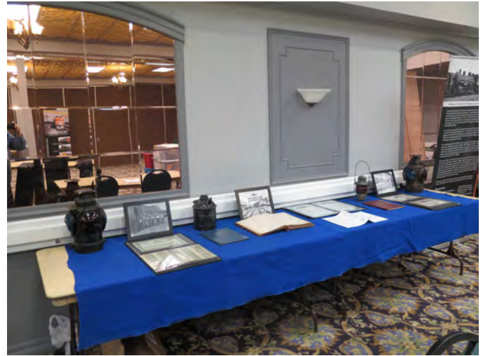
WP Artifacts Displays 5/12/22