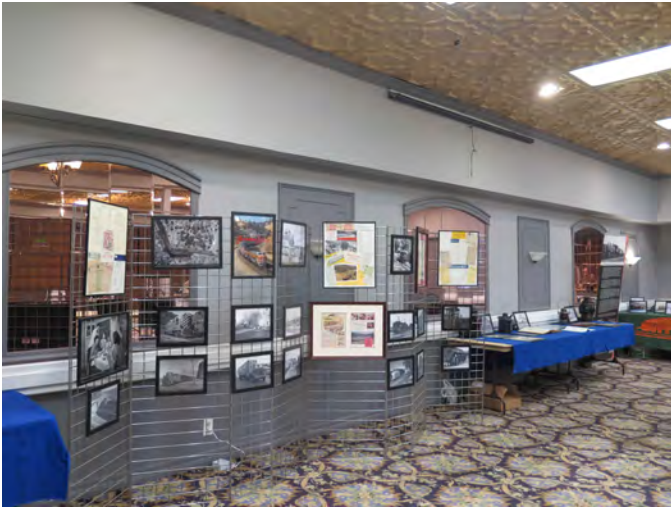
H/A Displays 5/12/22