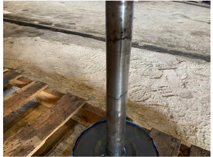
Repair WP165 pump shaft ready to reinstall.