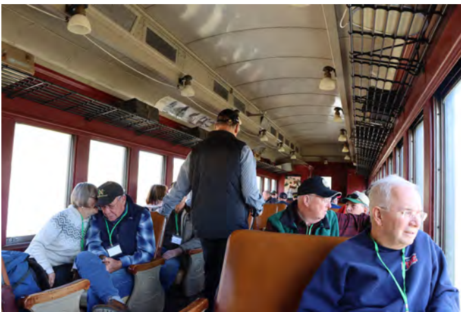
Riding the Virginia and Truckee