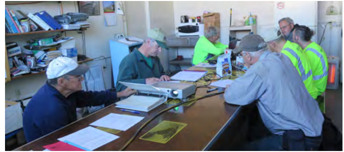
We held two crew training classes in 2022. The photo above is from the April class.