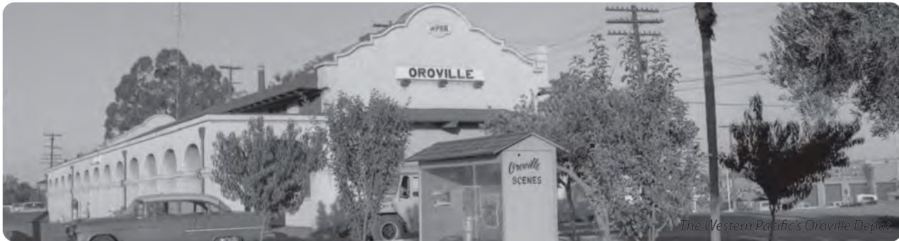
The Western Pacific's Oroville Depot