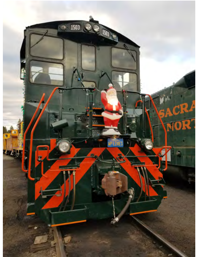
Santa Trains 2019