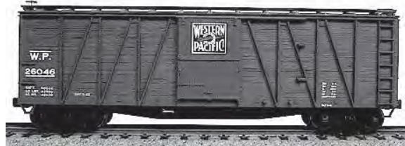
Western Pacific Convention Car!

AccuRail custom HO scale outside braced wood car with decals for numbering in the 26001 series. Limited quantity!