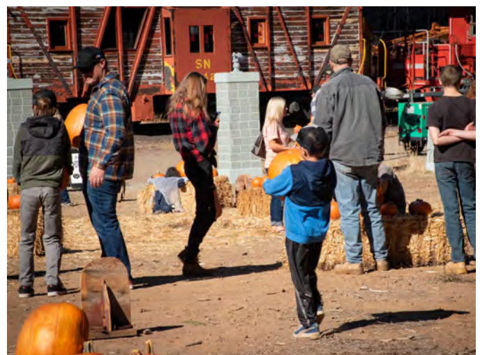
Pumpkin on its way home