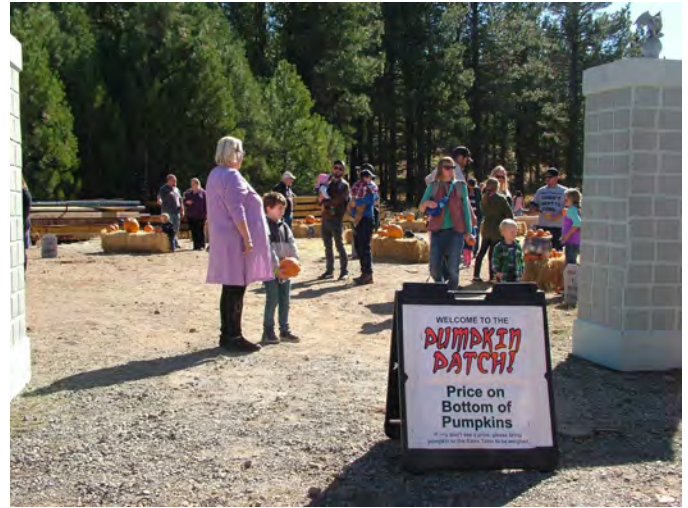
Pumpkin Patch Entrance

We plan to run the Pumpkin trains again in 2020 and build the event even larger!