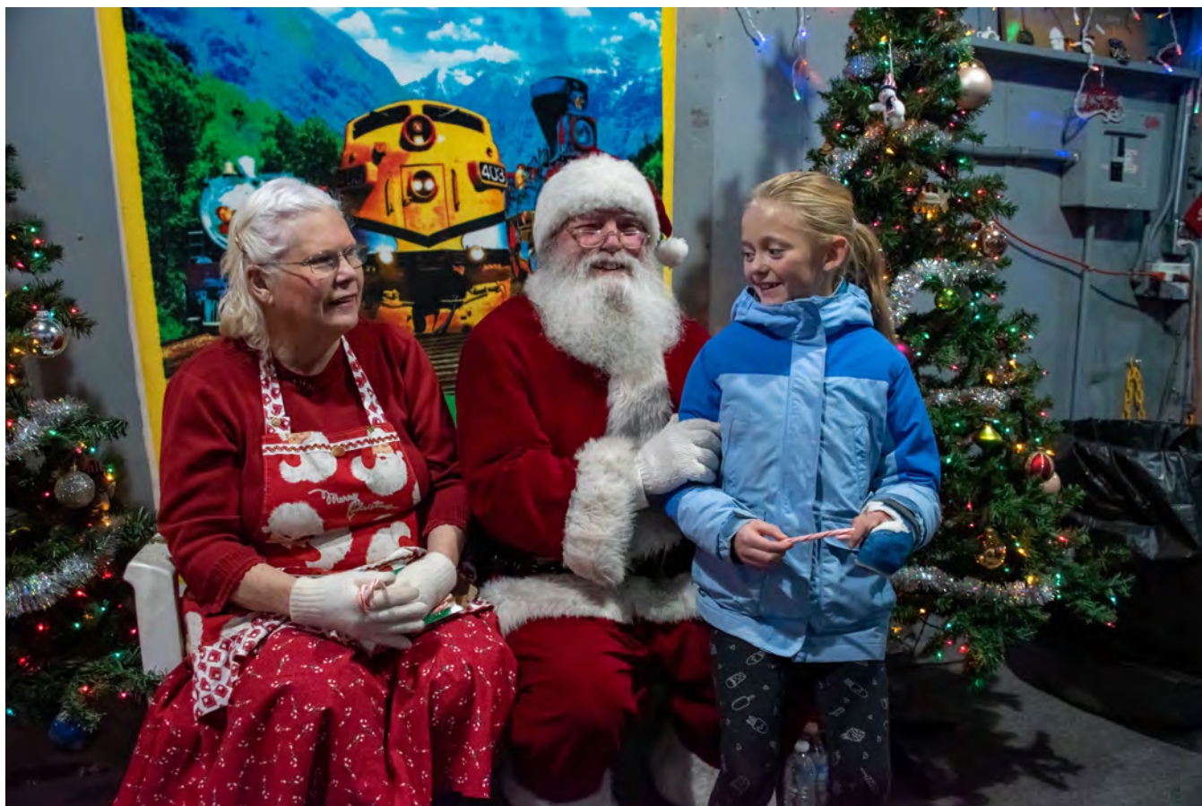
VIPs at Santa Trains 2019