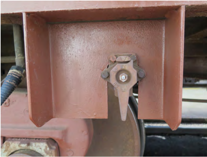
Retainers from our collection.