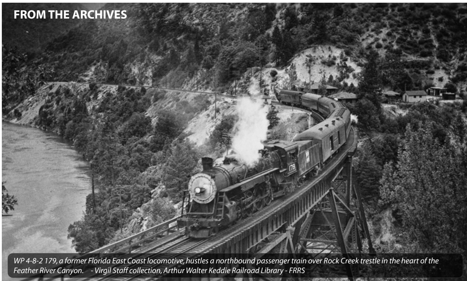
WP 4-8-2 179, a former Florida East Coast locomotive, hustles a northbound passenger train over Rock Creek trestle in the heart of the Feather River Canyon.