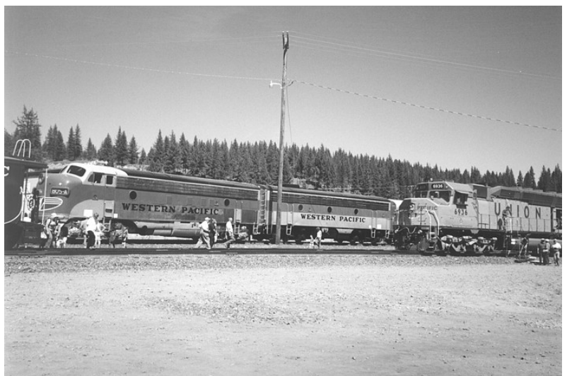
Visitation of the equipment thinned somewhat during lunch but quickly picked up shortly after on both days.

allowed to “walk” past the derailment and continue non-stop for Roseville arriving and securing the train with our watches showing 5 am. After some much needed sleep, we departed Roseville for Portola at 1 pm on Monday September 10. We ran non-stop to Oroville but before arrival, I was instructed to call the Dispatcher on the phone ASAP. At this time we were notified that another derailment had occurred ahead of us in the Feather River Canyon at Belden and they were unsure of when the track would be opened so they were going to take us up to James and call a relief crew. At this point, I talked with Steve and decided the best thing for the equipment was to park at Oroville for the night and try again in the morning. Once Omaha realized that we were a “free” crew, they agreed to our request and once again we tied the equipment down for the night. Steve and I, along with Vic Neves and John Walker, made a couple of trips down to the yard that night to make sure our train was safe and the “free riders” had not made