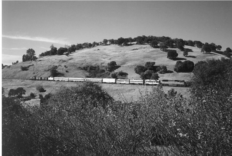
Descending towards Oroville our train has just negotiated the horseshoe curve between James and Elsey. - Dave Bergman

Early Tuesday morning, we assembled the train in Portola Yard and began the trek westbound. Stopping briefly at Kiddie for photographs and a quick inspection of the equipment we then continued non-stop to Oroville where another inspection of the train was performed. Departing Oroville we soon achieved the speed limit imposed by UP on the fairly flat run to Sacramento and arrived in Roseville about 9 pm. We spotted the entire train next to the main office building under the watchful eye of the UP special agents and in clear view of one of the surveillance cameras. At this point, Steve and I worked with the Terminal Managers to go get GP20 2001 (which had been cared for by the boys on the service track) out of the