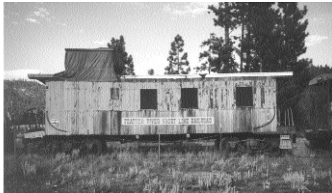
Completing our "style" collection of WP cabooses ex #779 was stored at Sloat when this photo was taken.

Because of a need to use the storage space for other purposes, the caboose and outfit car were given to the Sloat Mill Company and moved to a siding track at Sloat in 2000. WP caboose number 463, acquired by FRSL from Plumas County, was also moved