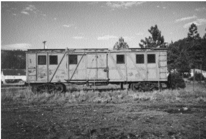
Shown at Sloat prior to movement to Portola, CVL 2 is now part of our collection. - Norm Holmes

When our museum was getting started we invited the FRSL