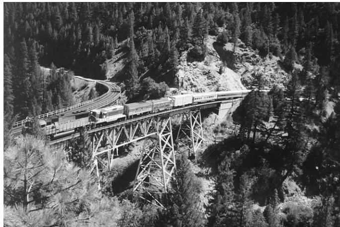
Traversing the Keddie Wye for the first time in many years our special movement looked great.

Following the success of our journey to Truckee last year and having worked throughout the year on equipment restoration our confidence was high for another successful journey. The difference this time would only be the route to Truckee. Previously, using our own power, we had been routed via the Reno Branch to Truckee. With that branch clogged with stored cars our route this year would take us down Feather River Canyon to Roseville and then over Donner Pass to Truckee. Through many hours of planning and phone calls, we were scheduled to depart Portola for the first leg of our trip on September 1. In preparation our equipment had been inspected and approved for movement according to the movement schedule previously submitted to Union Pacific. At 4:20 pm on August 31 a call was received from Union Pacific regarding our need to obtain a waiver for movement from the Federal Railroad