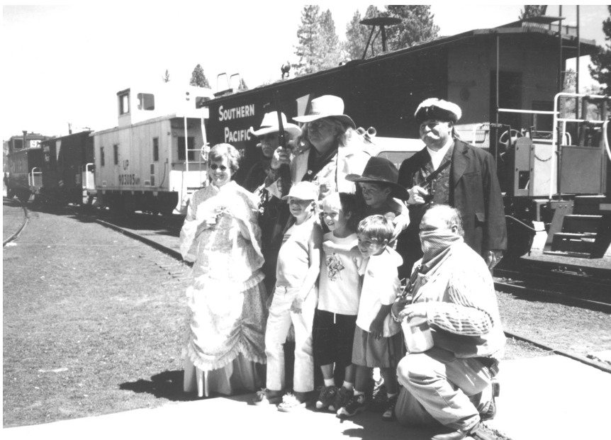
The Truckee Regulators who held up the train during the days events pose with some of the days visitors.