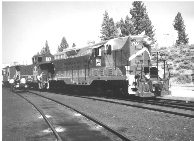
Freshly painted GP-7 707 flies white flags while powering the caboose train during Railroad Days.

The impetus for the Board of Directors to approve such an ambitious schedule came from the proposed Reno Branch excursion, which is planned for a time when the Reno Branch is devoid of stored freight cars. Until then, work goes on with the