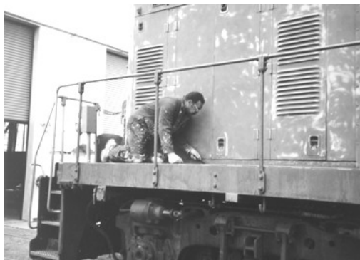
Many hours were spent preparing 707 for the new Silver and Orange paint.

What is happening at Portola is nothing short of fabulous. It is long overdue. It is hoped by the managers of this project that a new flame that will burn brightly in the preservation community has been lit.