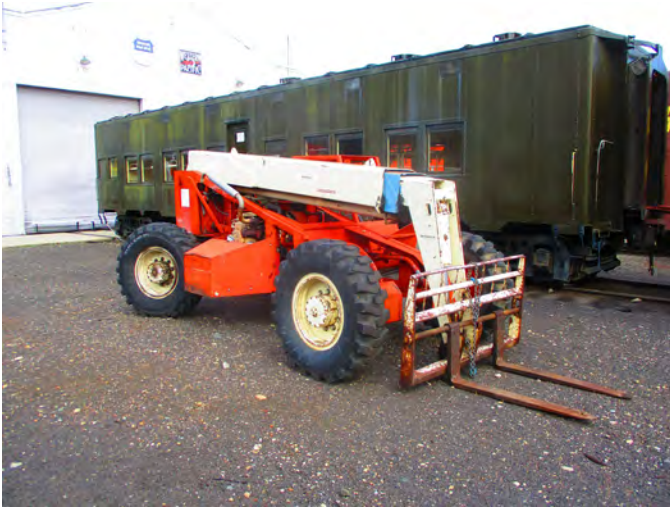
LOED 534A Material Handler