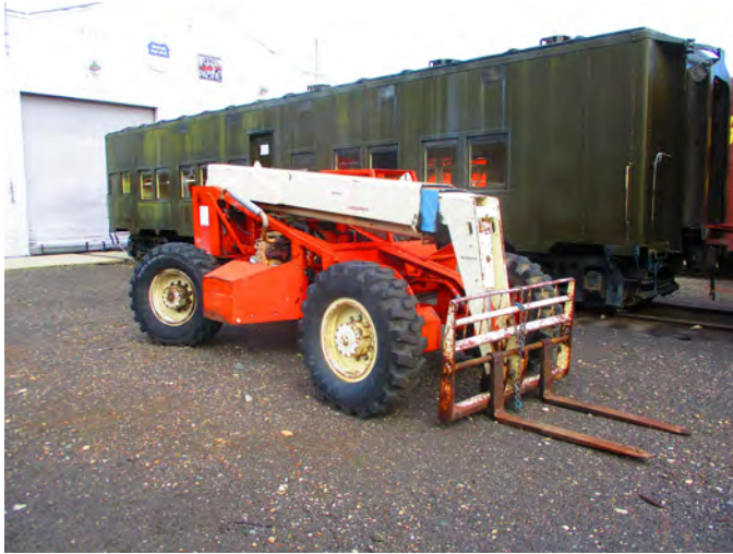
LOED 534A Material Handler