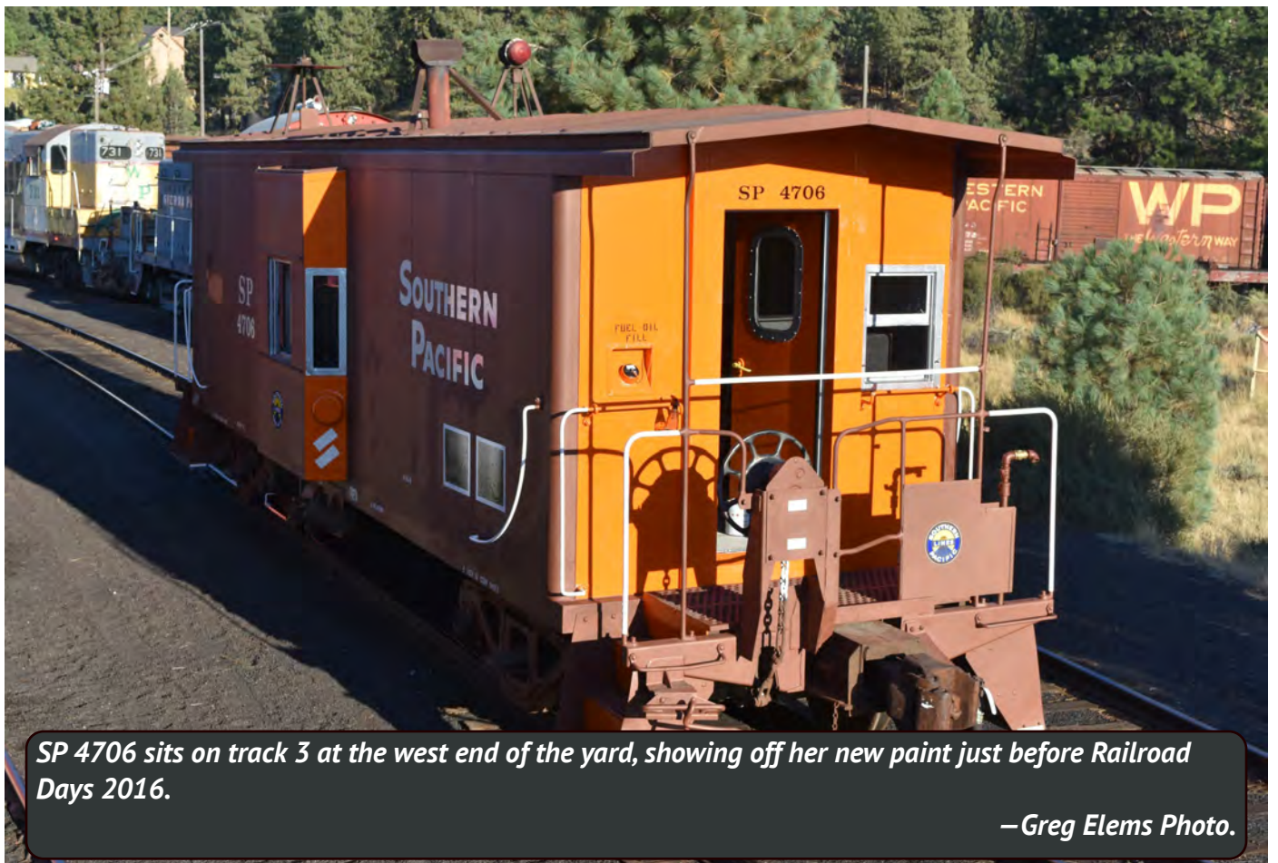
SP 4706 sits on track 3 at the west end of the yard, showing off her new paint just before Railroad Days 2016.