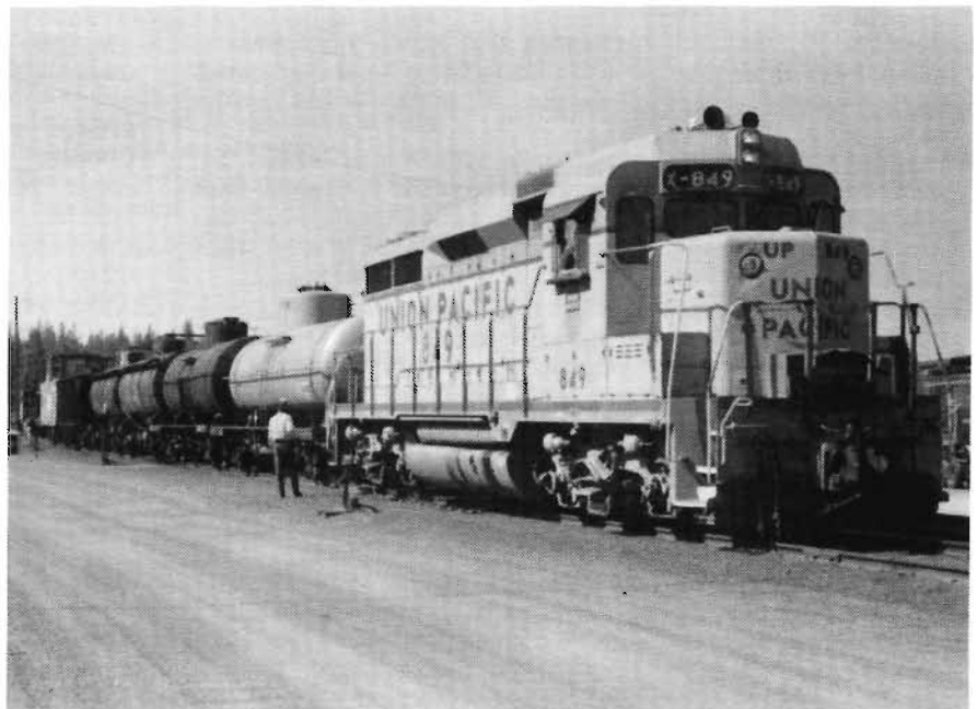
Railfan Day Train #3 with GP 30 UP 849 and tank car train has just made a photo run-by.