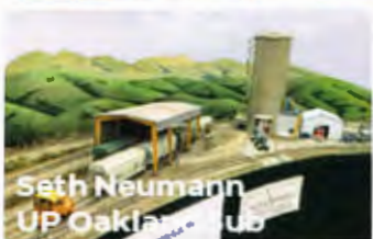
Seth Neumann UP Oakland Hub