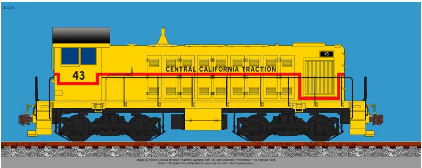
Central California Traction Company chrome yellow