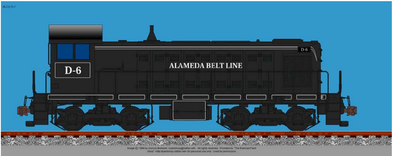
Alameda Belt Line delivery scheme - black with pinstripes

We present the following five paint schemes for consideration by the Board: